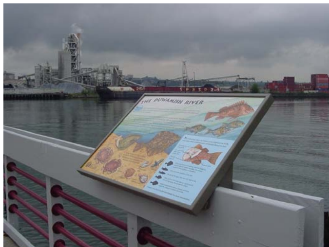
Duwamish River seafood consumption advisory sign at Terminal 105

The following recommendations will lower your exposure to contaminants from sediments and seafood from the Lower Duwamish Waterway until cleanup activities effectively lower contaminant levels in sediments, crab, shellfish, and fish.