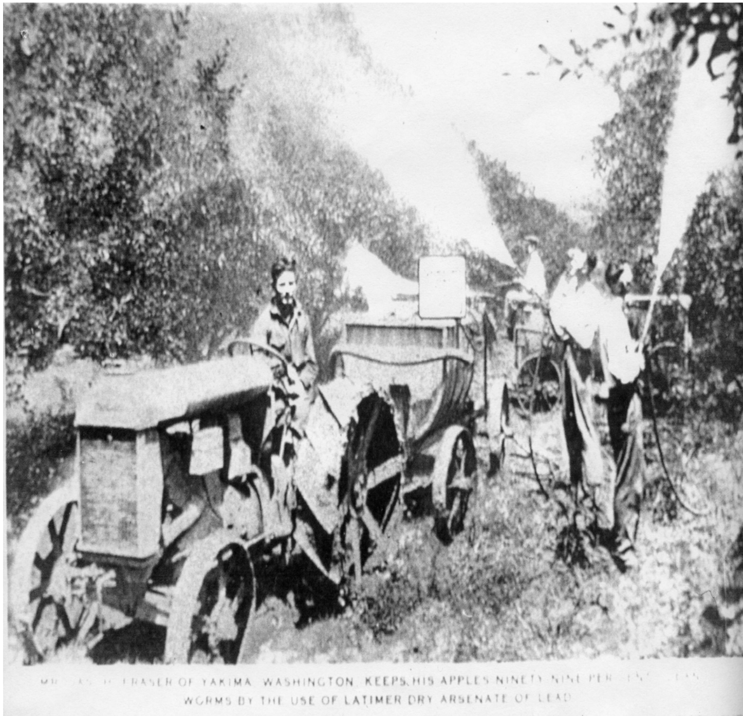
Figure 2. Farmers spraying Lead Arsenate in pears and apples in Eastern Washington.