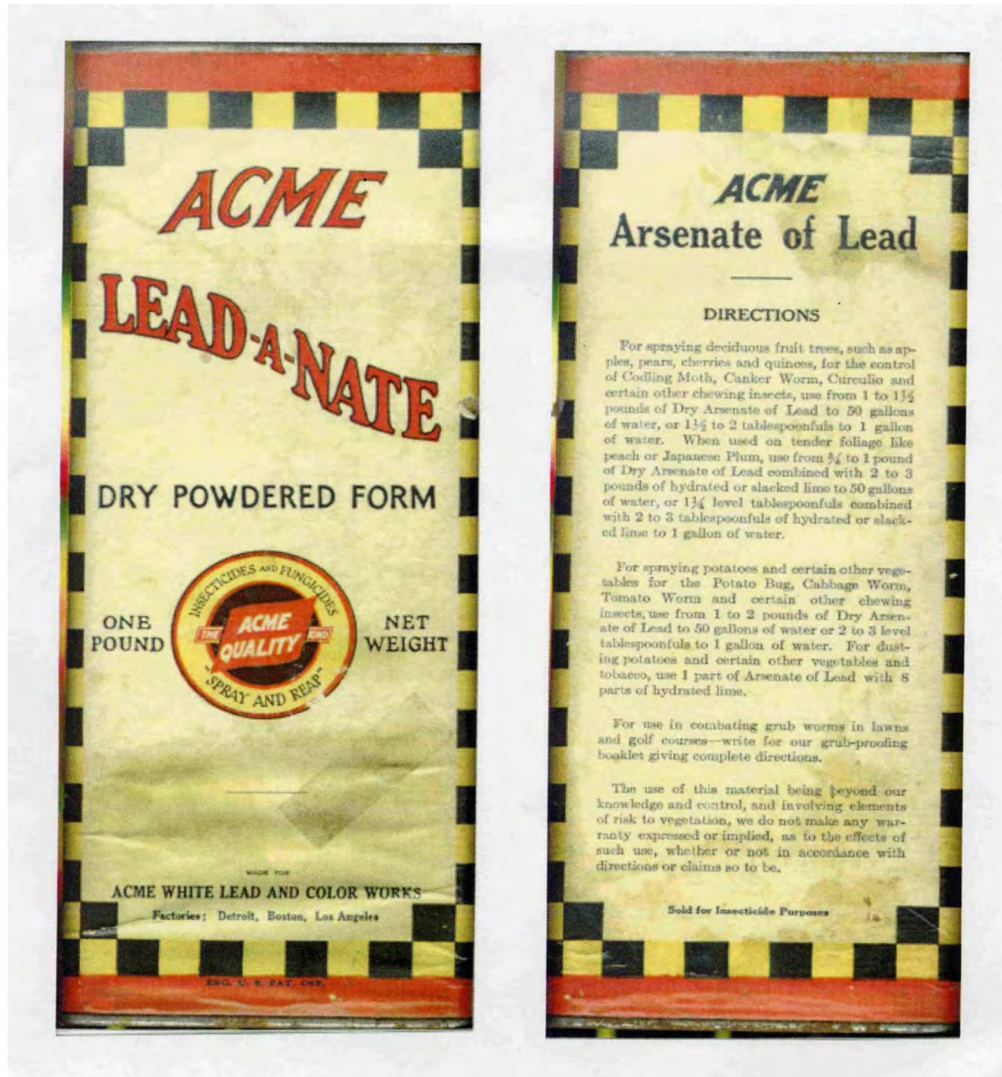
Figure 3. Directions for spraying lead arsenate in deciduous fruit trees, Eastern Washington.