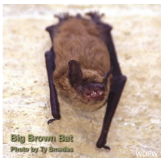
Big Brown Bat