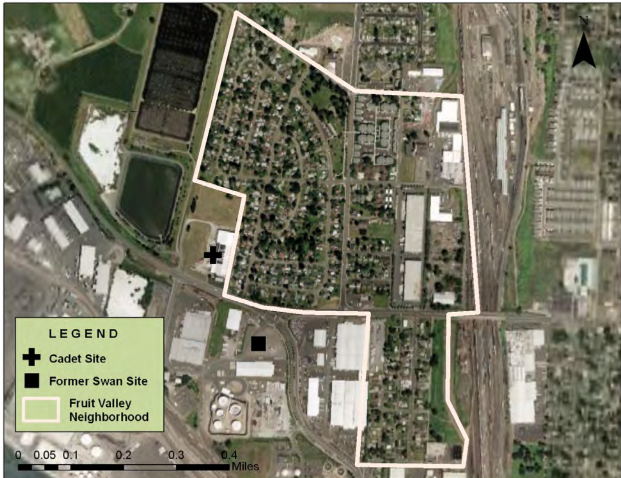
Figure 1 – Cadet/Swan Sites and Approximate Boundaries of the Fruit Valley Neighborhood Residential Area underlain by Solvent Contaminated Groundwater

Residents of the Fruit Valley neighborhood get their drinking water from the City of Vancouver. This drinking water is not affected by the contamination from the Cadet or Swan sites. Although residents are not drinking the contaminated groundwater, environmental studies conducted by Cadet and the Port of Vancouver (Port), which are being monitored by the Washington Department of Ecology (Ecology), show that solvents found in shallow groundwater are evaporating and moving up through the soil and entering some neighborhood homes. Based on indoor air testing, however, the solvents, when entering homes, are low and often similar to levels found in outdoor air. A small amount of the solvents might also be entering outdoor air.