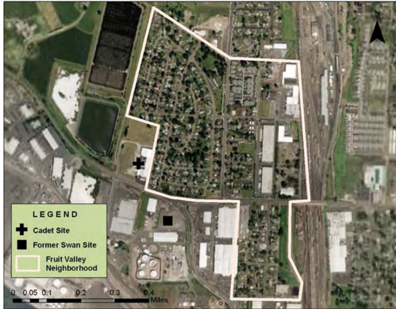
Figure 1. Cadet & Swan Manufacturing sites, Vancouver, Washington