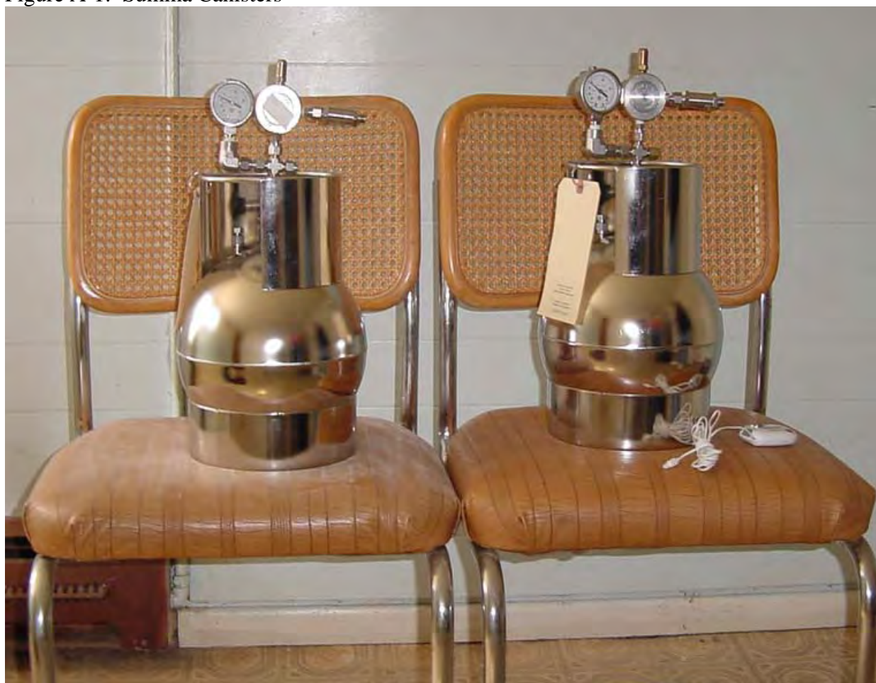
Figure A-1: Summa Canisters

The vacuum gauge is used to measure the amount of vacuum in the canister. The indoor air testing must be completed before the Summa canister loses its vacuum otherwise air will not be sucked into the canister. The flow control device controls the amount of air entering the canister so the air can be tested for different time periods. Indoor air testing at homes in the FVN was conducted for 24-hour periods to estimate the levels of chemicals people could be breathing throughout a day.