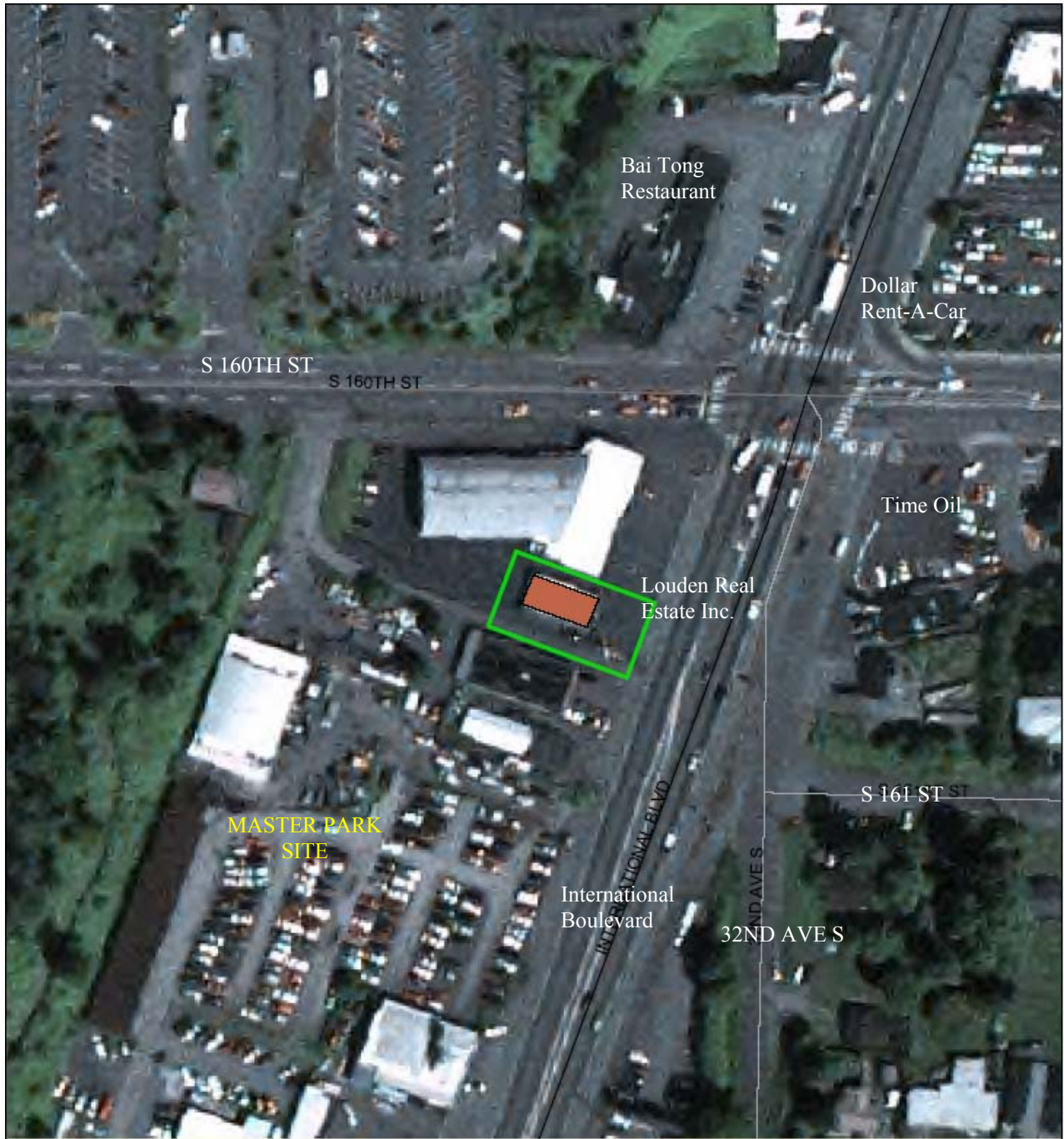
Figure 1 – Vicinity Map Master Park Site SeaTac, Washington