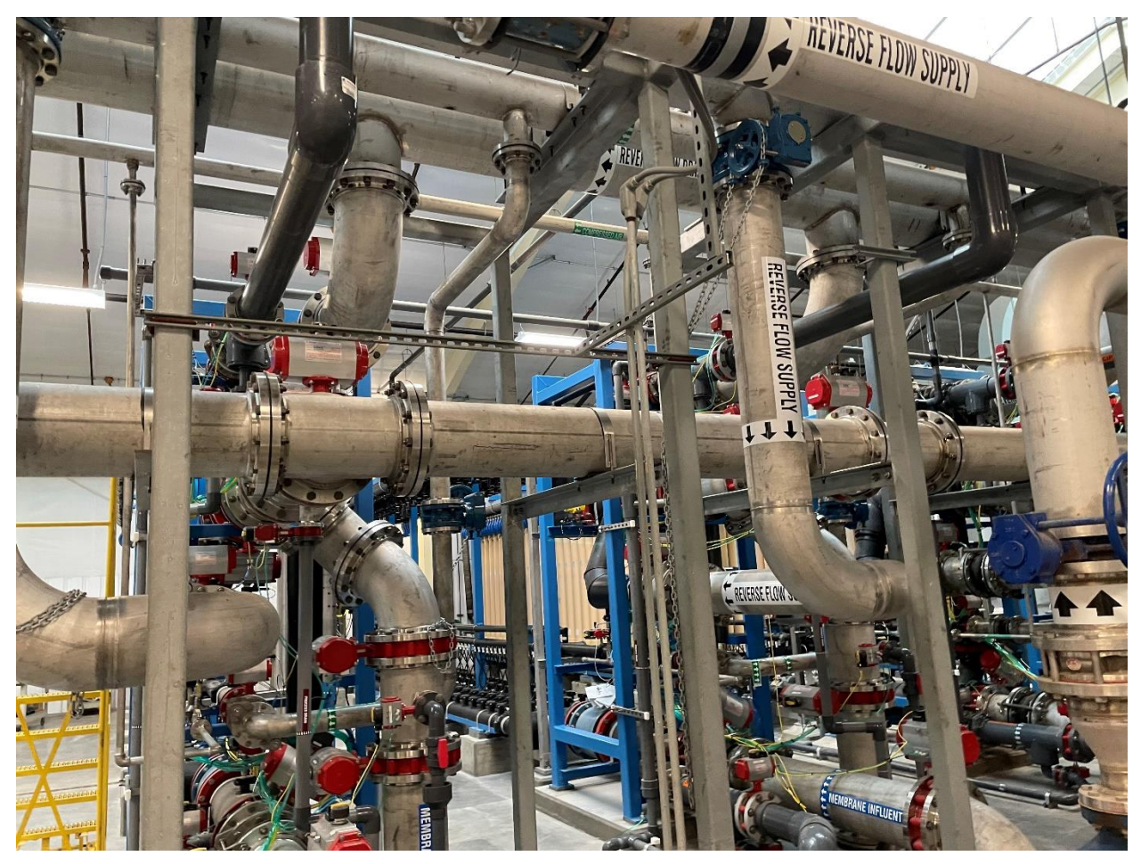
West Pasco Water Treatment Plant, Benton County, Filtration FTP Improvements.