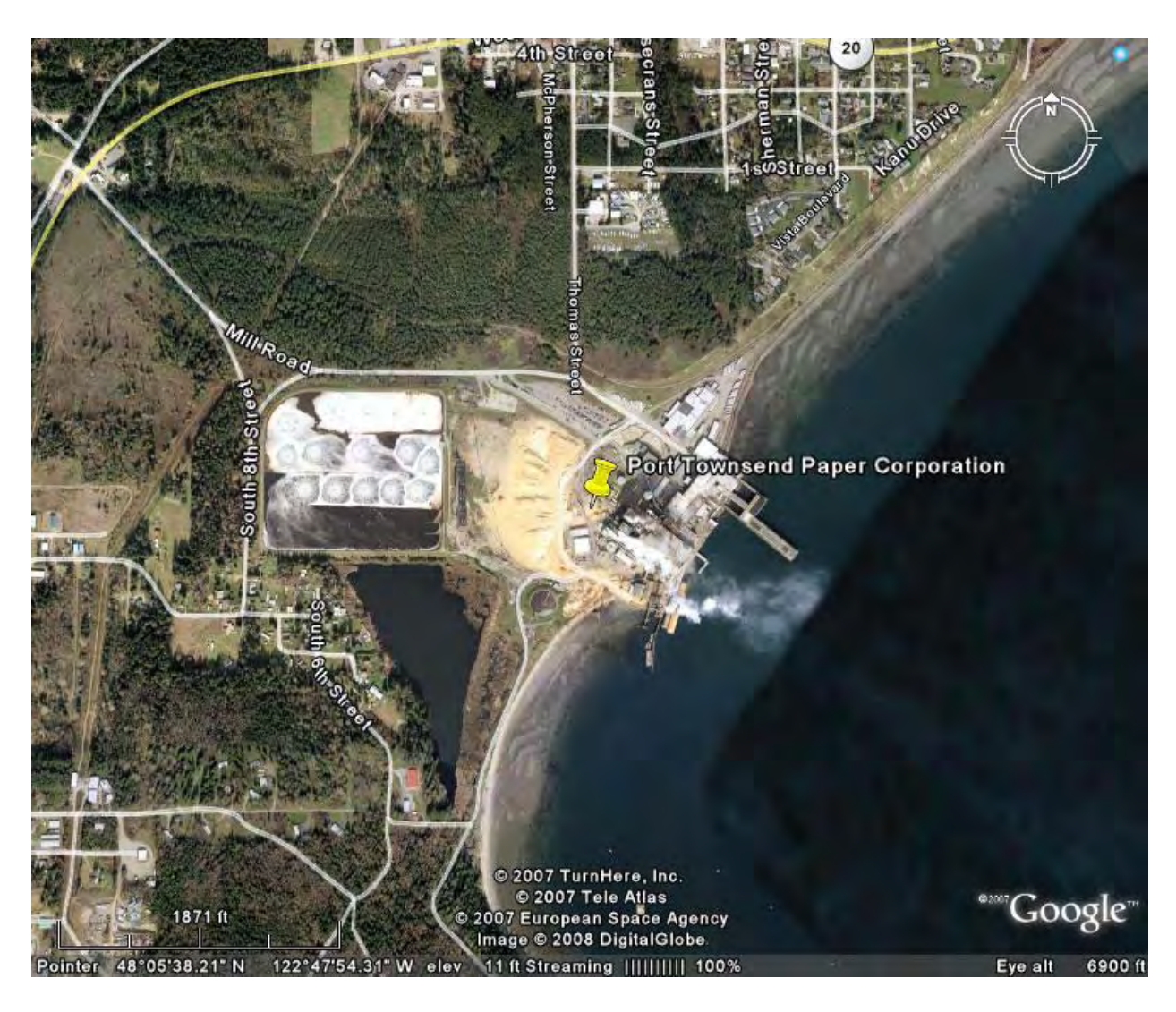
Figure 1. Port Townsend Paper Mill, Jefferson County, Washington