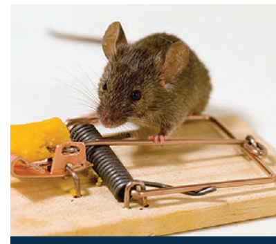
Use traps instead of rodent poison.