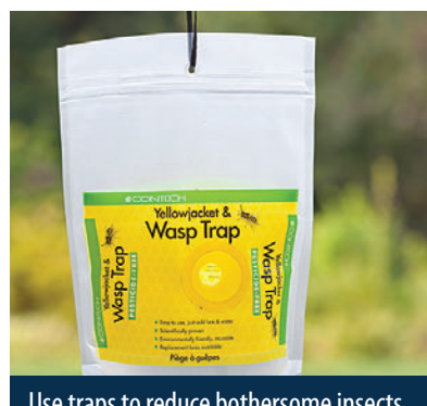
Use traps to reduce bothersome insects.