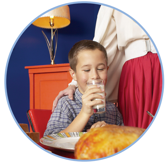
Food and drinks for kids