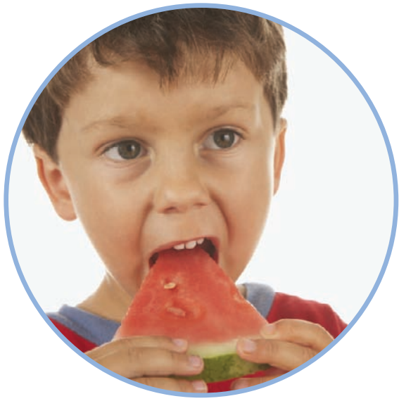
Raising a healthy eater