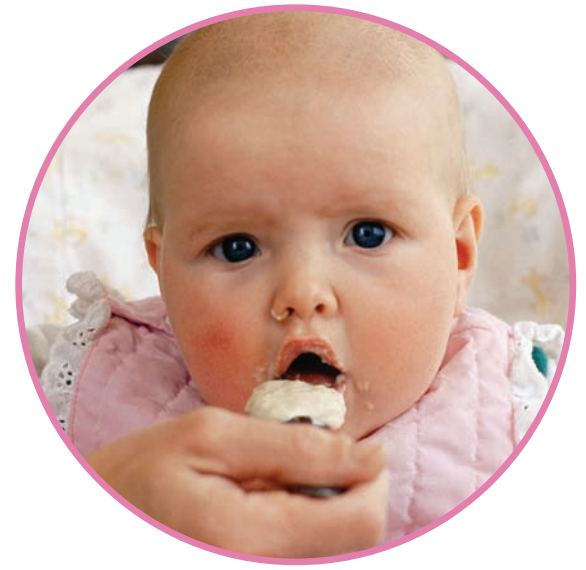
Baby's first foods