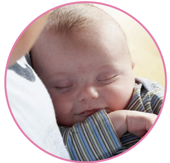
Signs that baby is hungry or full