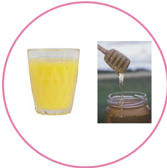
Food and drinks to avoid