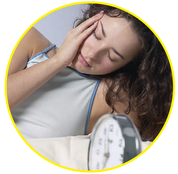
Nausea, constipation & heartburn