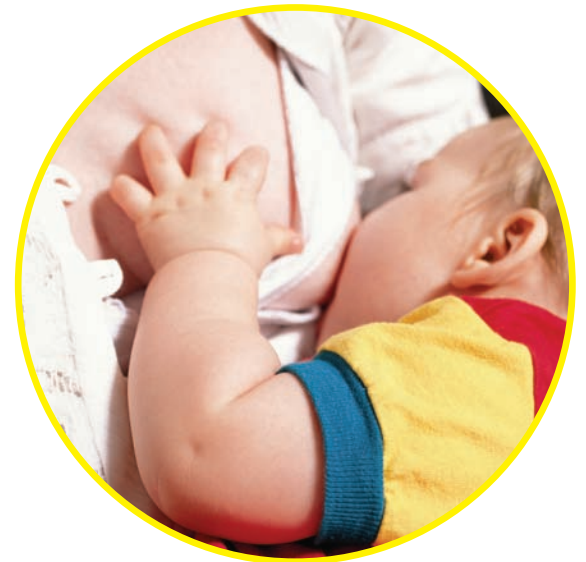
Breastfeeding my baby