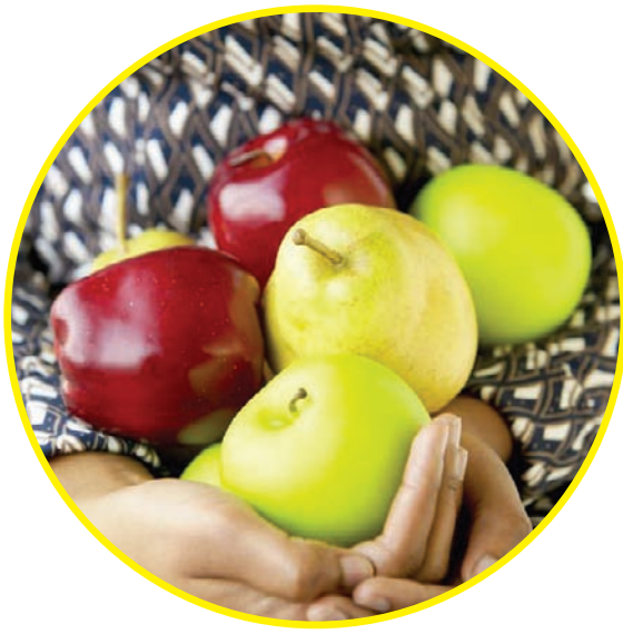
Eating during pregnancy