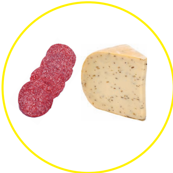
Unsafe foods during pregnancy