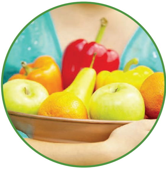
Healthy foods to eat