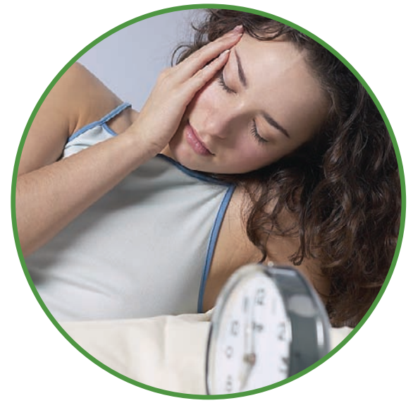
Relief from constipation