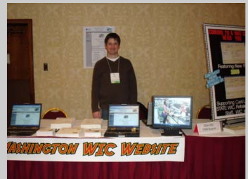
WASHINGTON WIC WEBSITE