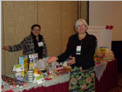
NEW FOODS 2009 DISPLAY