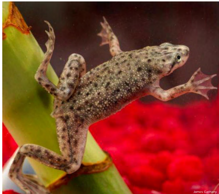
African dwarf frogs are common additions to fish aquariums. They have been associated with a large nationwide outbreak of Salmonella . Nearly 80% of those infected have been children under 10 years old, which highlights the need for proper hand washing after touching any amphibian or their water and housing.

More information about the national investigation and advice to consumers, pet store owners, health care providers, and veterinarians is available from the CDC at www.cdc.gov/salmonella/typh1209/index.html .