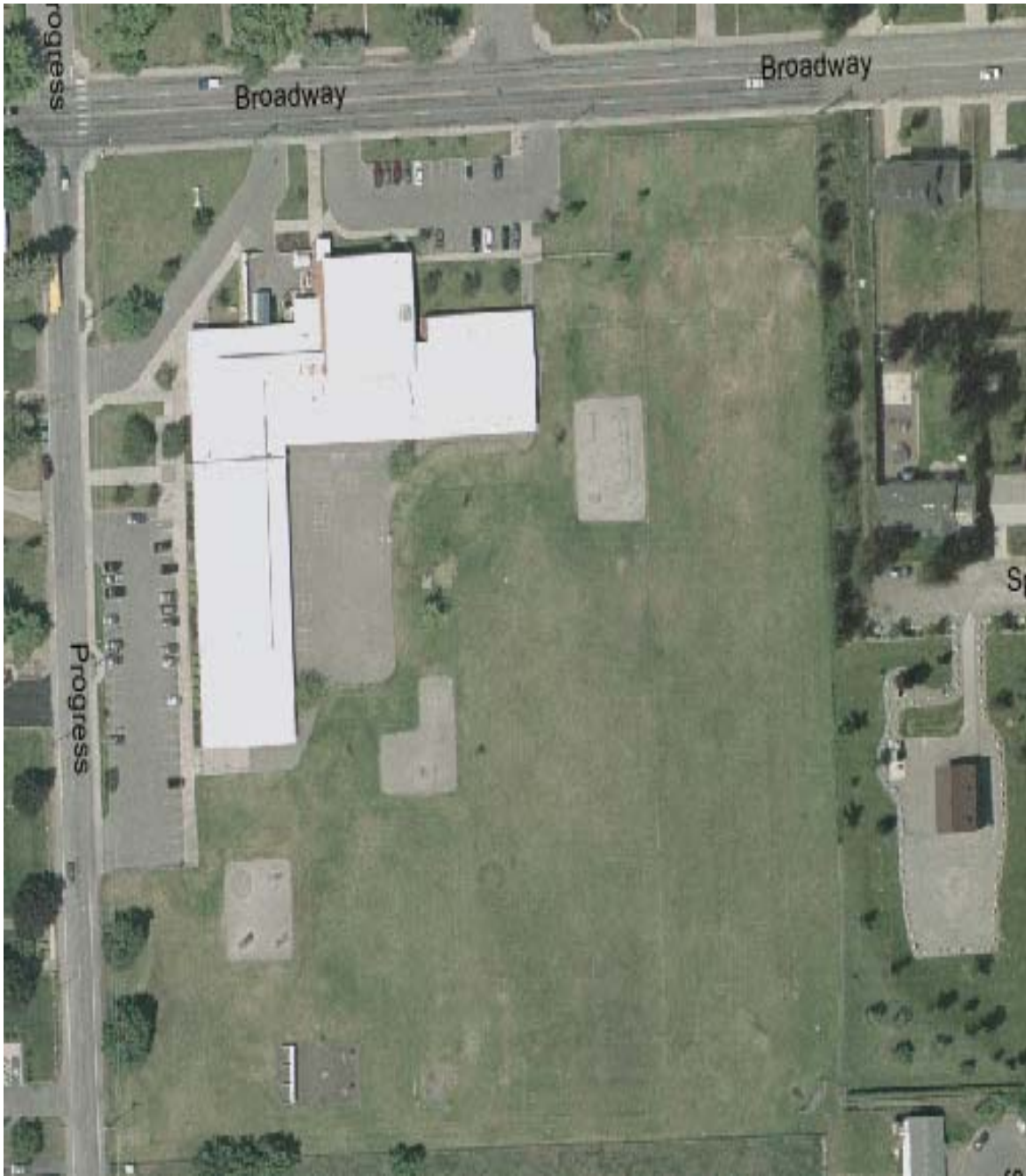
Figure 3. Aerial photo of Progress Elementary School, Spokane, Washington.