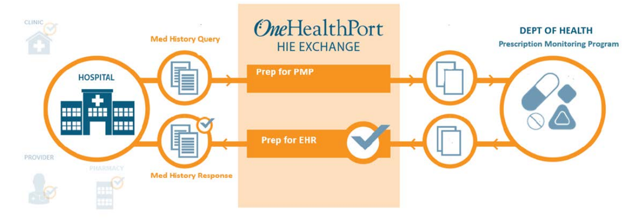
Figure 1: Basic diagram of EHR-HIE-PMP connection

Washington State received a grant from the Substance Abuse and Mental Health Services Administration (SAMHSA) in October 2012 to build a connection to the HIE. Initial connection with the HIE occurred in November 2013. After working through some barriers, the first emergency department connected to the HIE in November 2014.