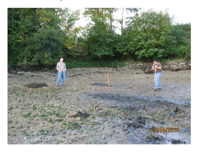
Figure 4 . Contaminated sediments at low tide during October 2010 resulting in emergency action removal of product pipe and sediments Bremerton, Washington.

likely received discharge from catch basins on the former MGP footprint on Parcels A and B (1). Cascade Natural Gas removed approximately 60 feet of pipe and plugged the end. They excavated sediment up to five feet deep and five feet around where the pipe was removed. The