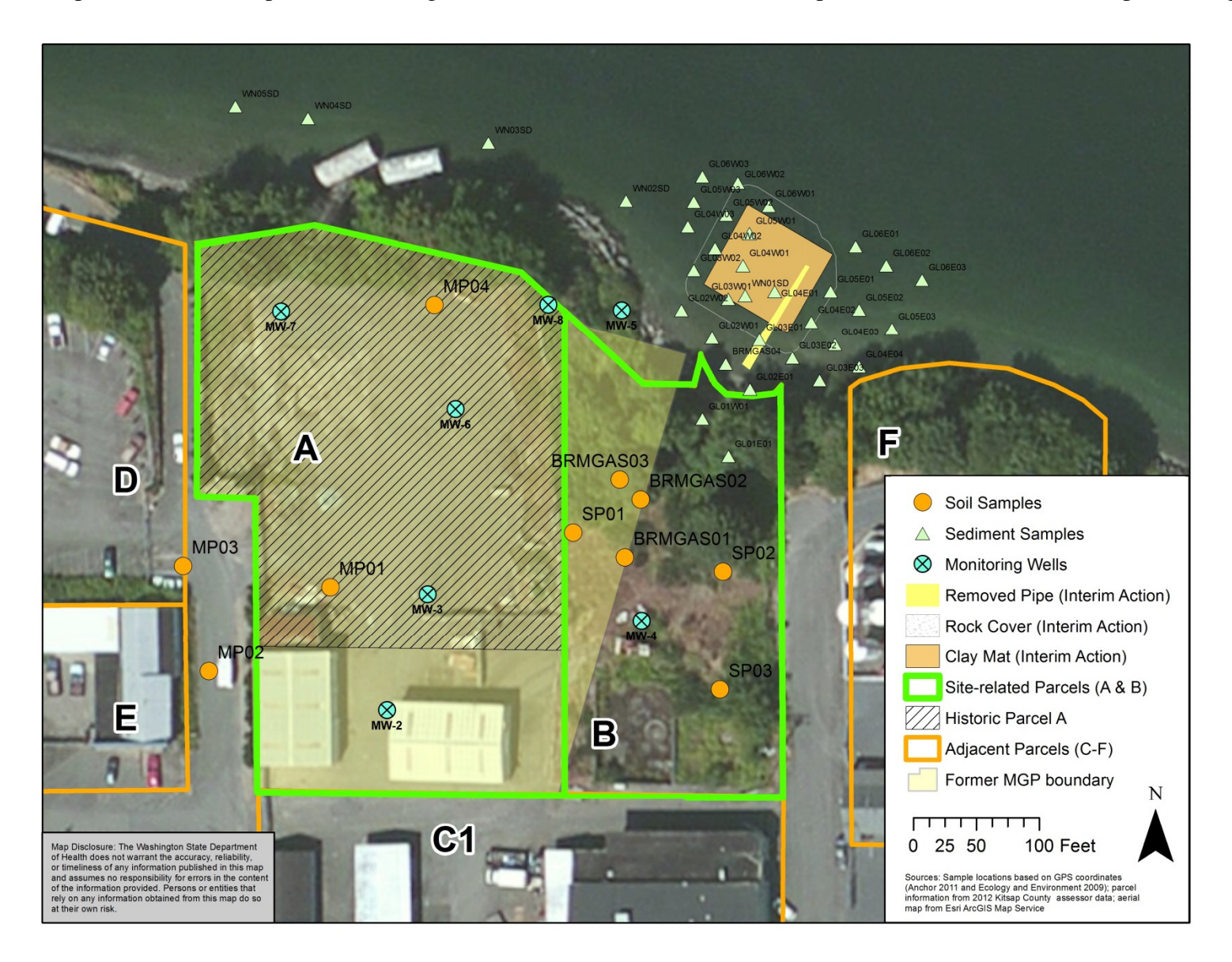
Figure 5. Sample locations from previous investigations at the Bremerton Gasworks Superfund site, Bremerton, Kitsap, Washington.