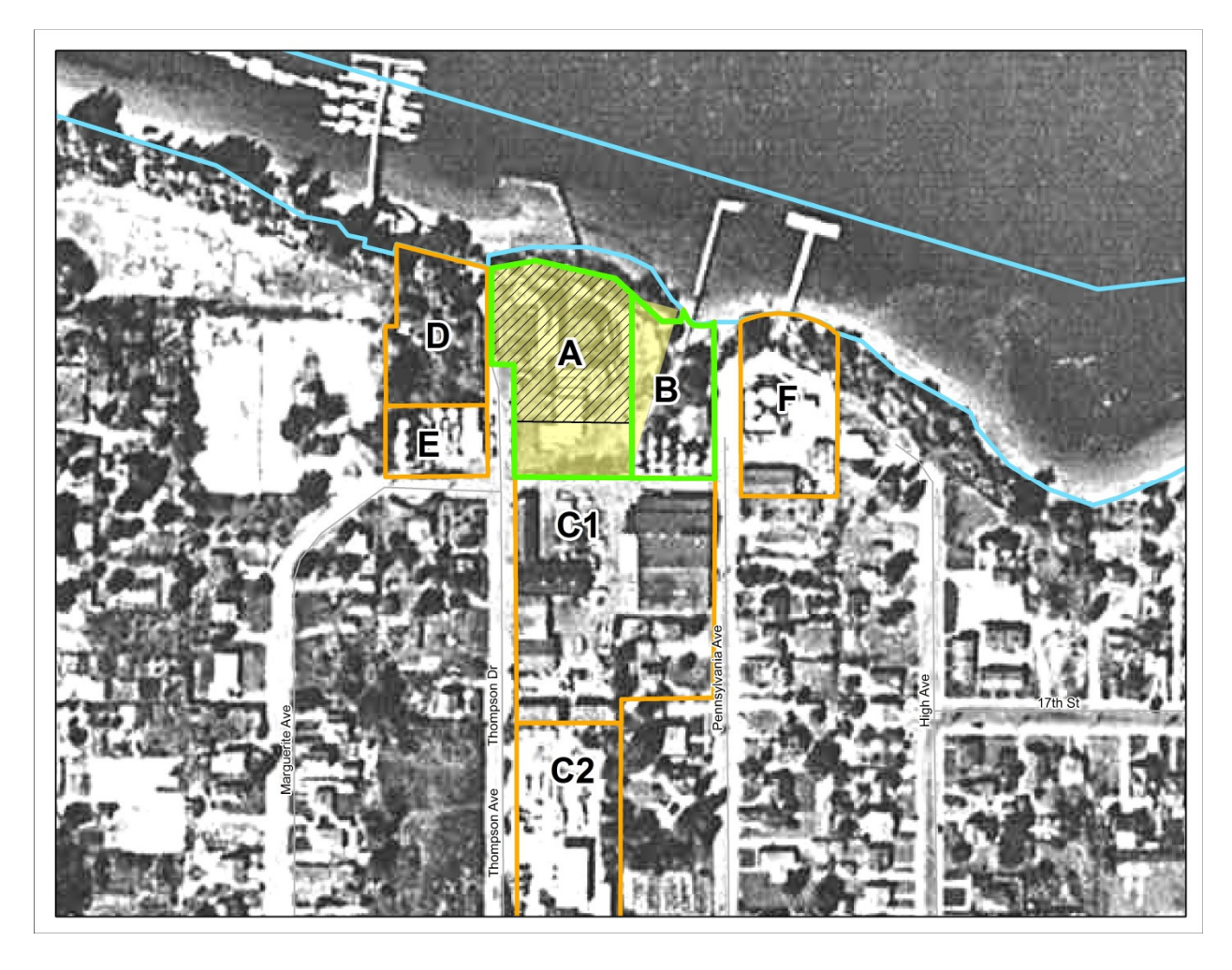
Figure 2. Historical aerial photo of the Bremerton Gasworks Superfund site area in Bremerton, Kitsap County, Washington.