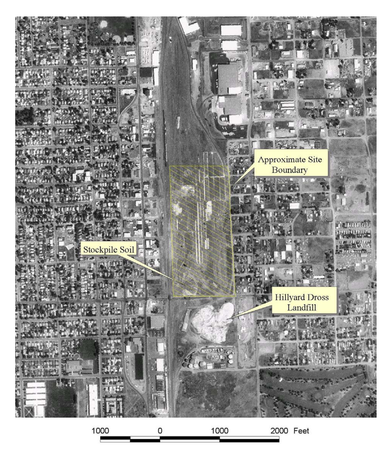
Figure 2: Arial photograph of Hillyard area, Spokane, Washington, showing the lead contaminated site, July 16, 1995.