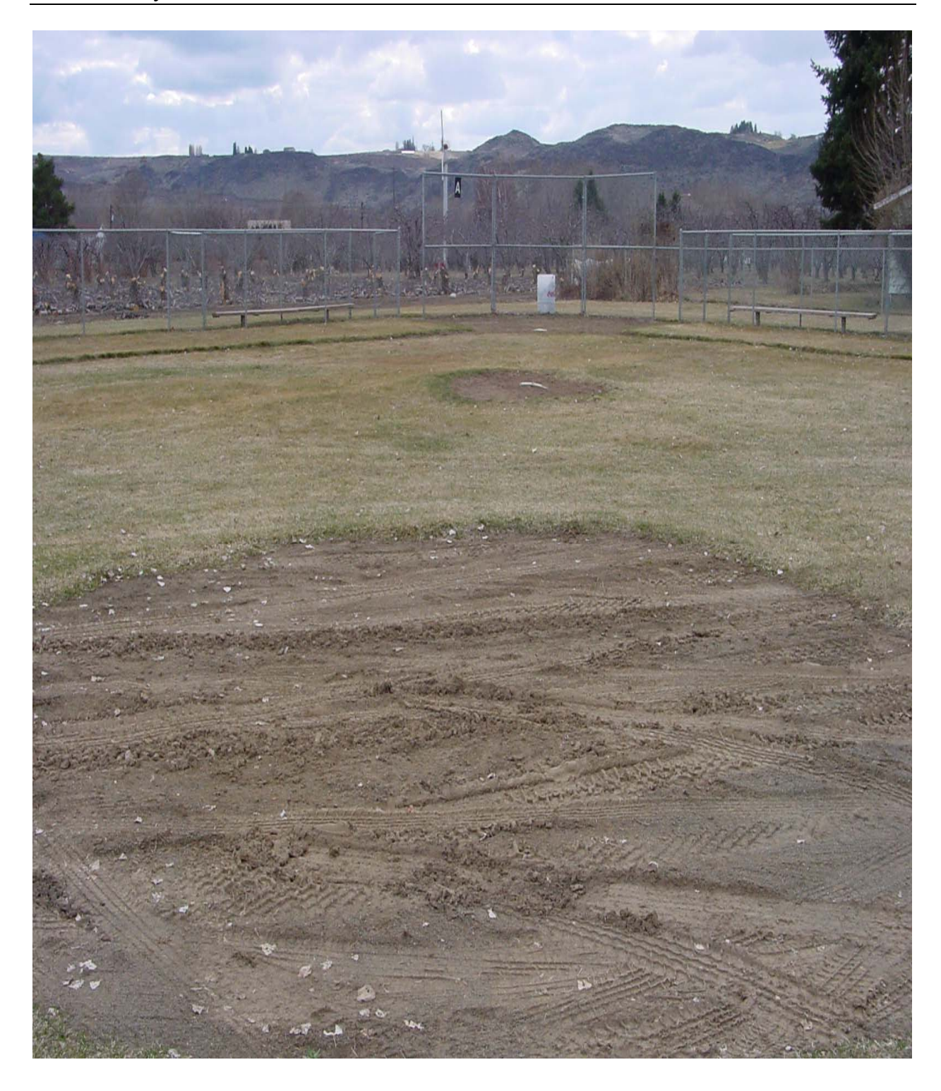
Figure 3. Softball field at Naches Valley Intermediate School, Naches, Washington.