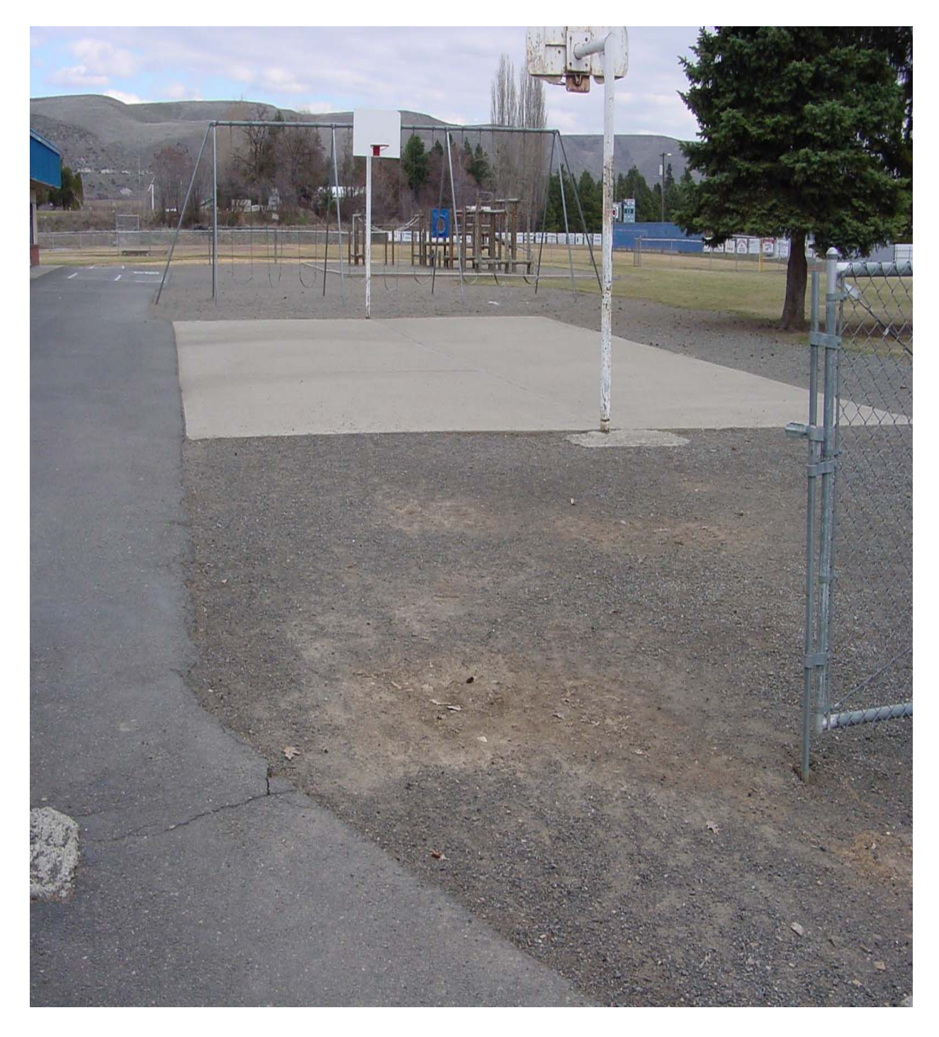
Figure 4. Naches Valley Intermediate School playfields, Naches, Washington.