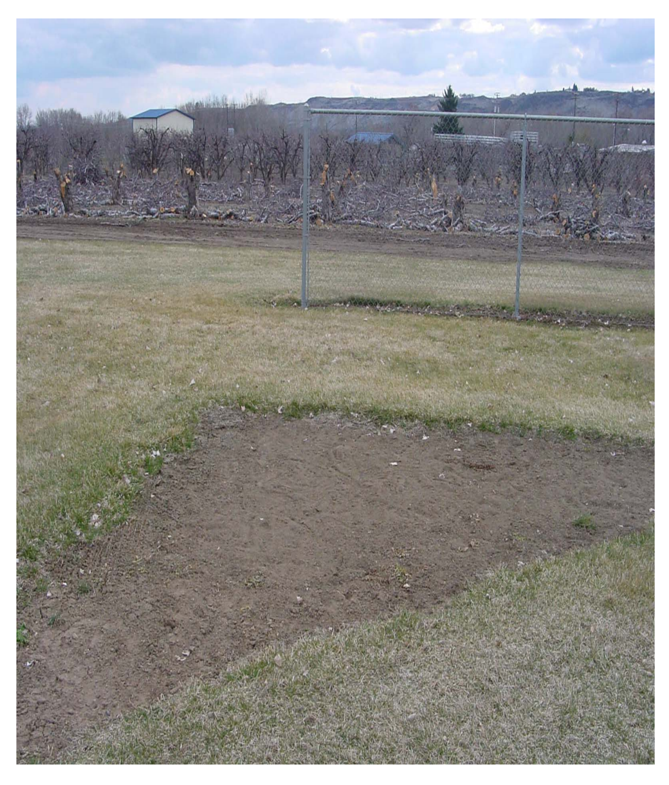
Figure 5. Naches Valley Intermediate School softball field with open access to an orchard land, Naches, Washington.