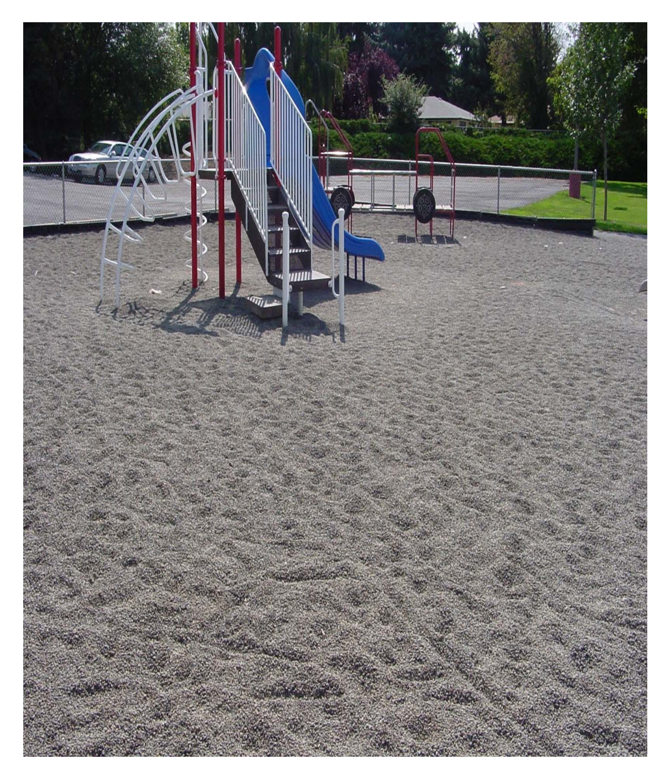
Figure 3. Playground field at Robertson Elementary School, Yakima, Washington.