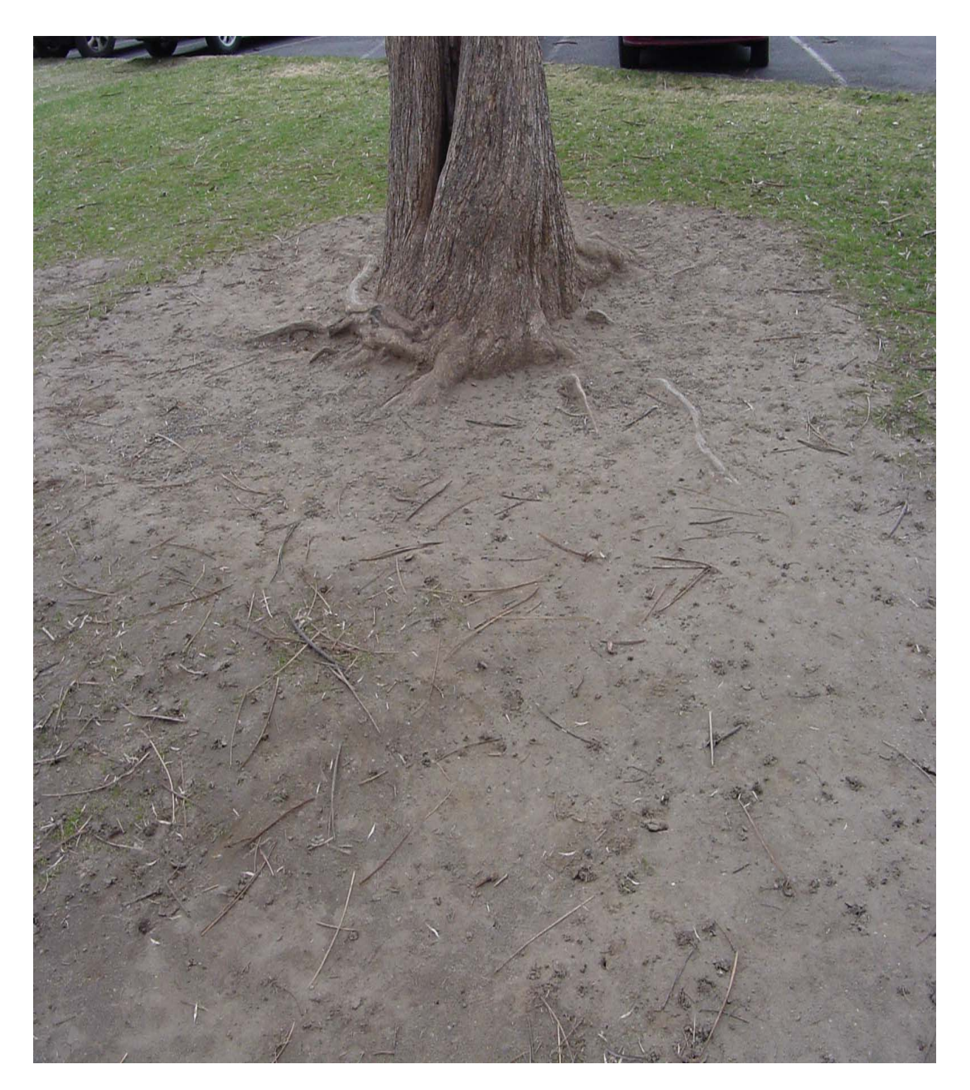
Figure 6. Exposed soil along trees, Robertson Elementary School, Yakima Washington.