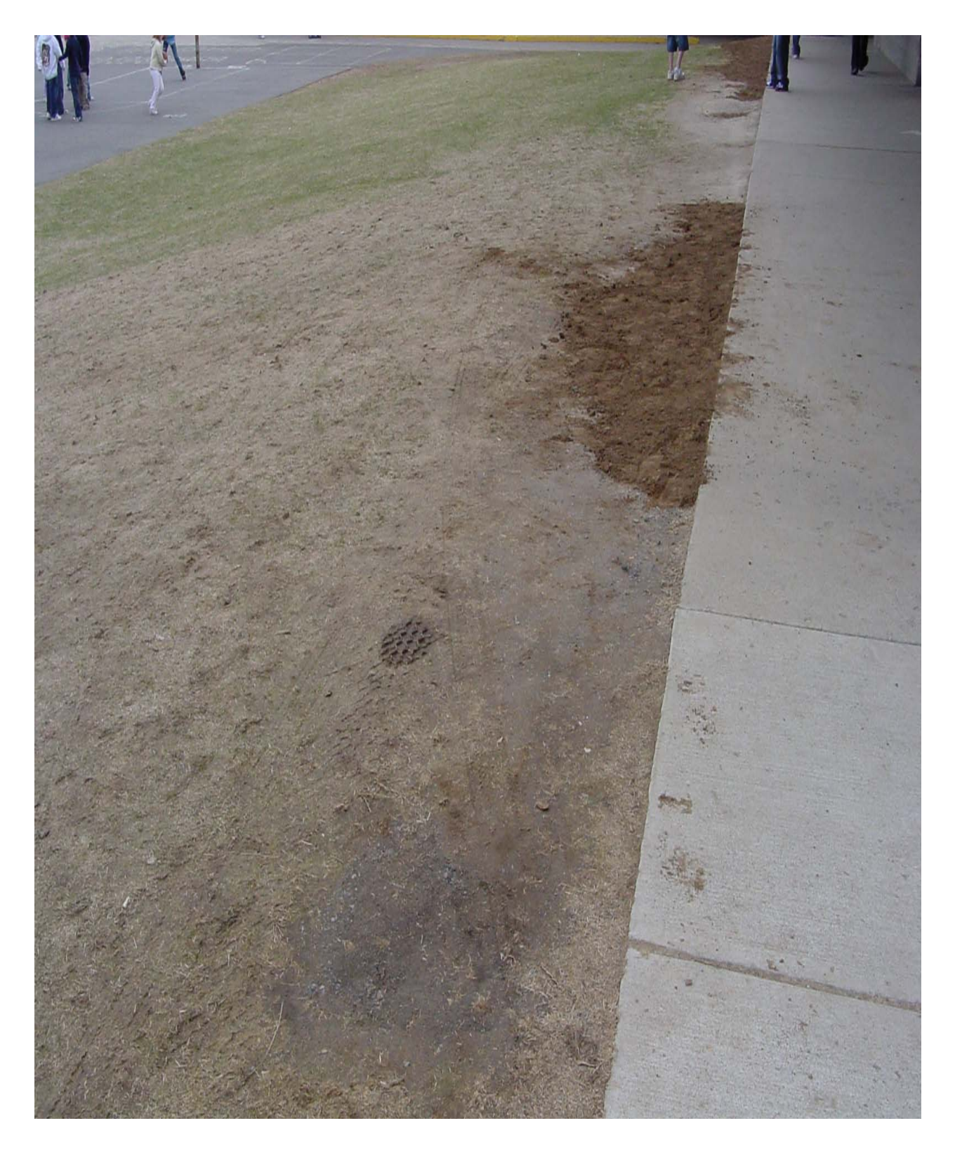
Figure 5. Robertson Elementary School playfields, Yakima Washington.