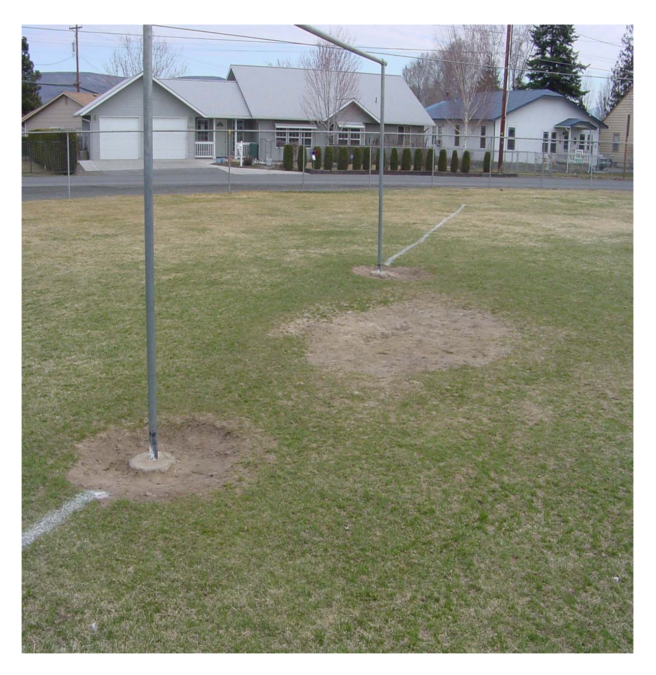
Figure 2. Exposed soil along soccer field, Robertson Elementary School, Yakima, Washington.