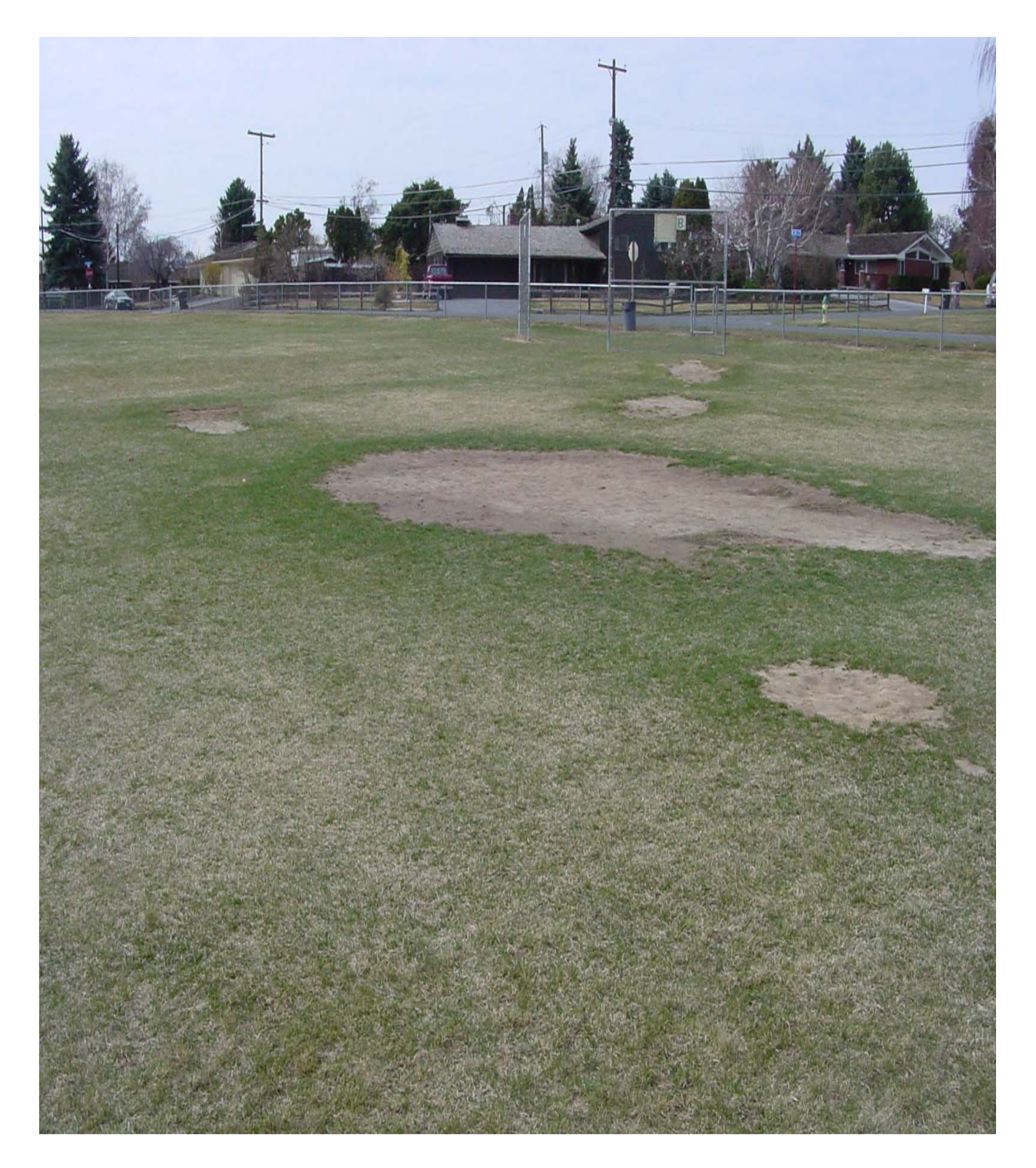
Figure 2. Exposed soil along baseball field, Gilbert Elementary School, Yakima, Washington.