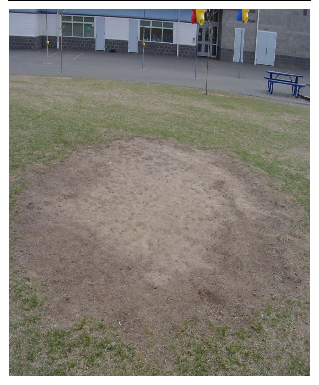
Figure 3. Playground field at Gilbert Elementary School, Yakima, Washington.