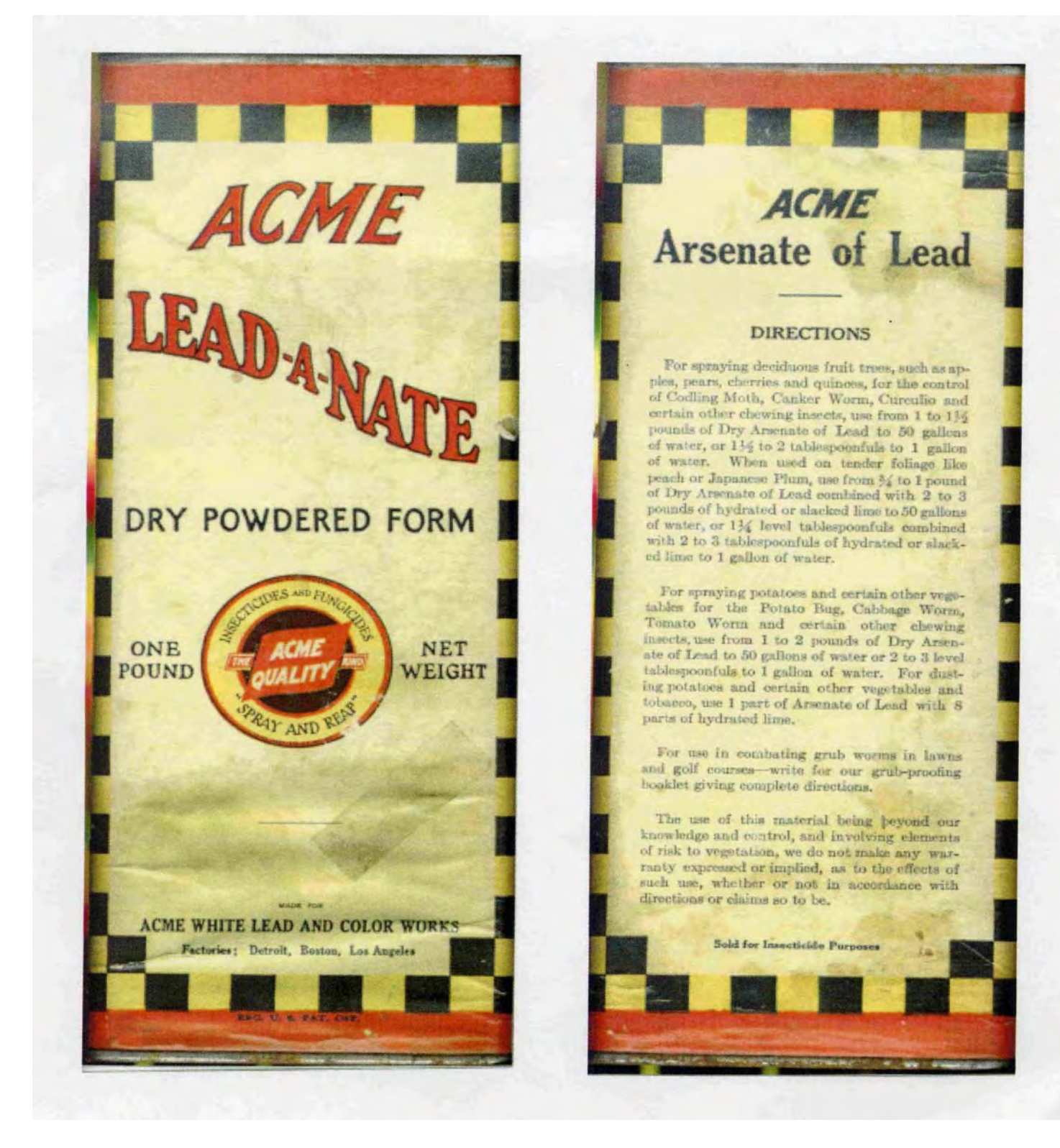
Figure 3. Directions for spraying lead arsenate in deciduous fruit trees, Eastern Washington.