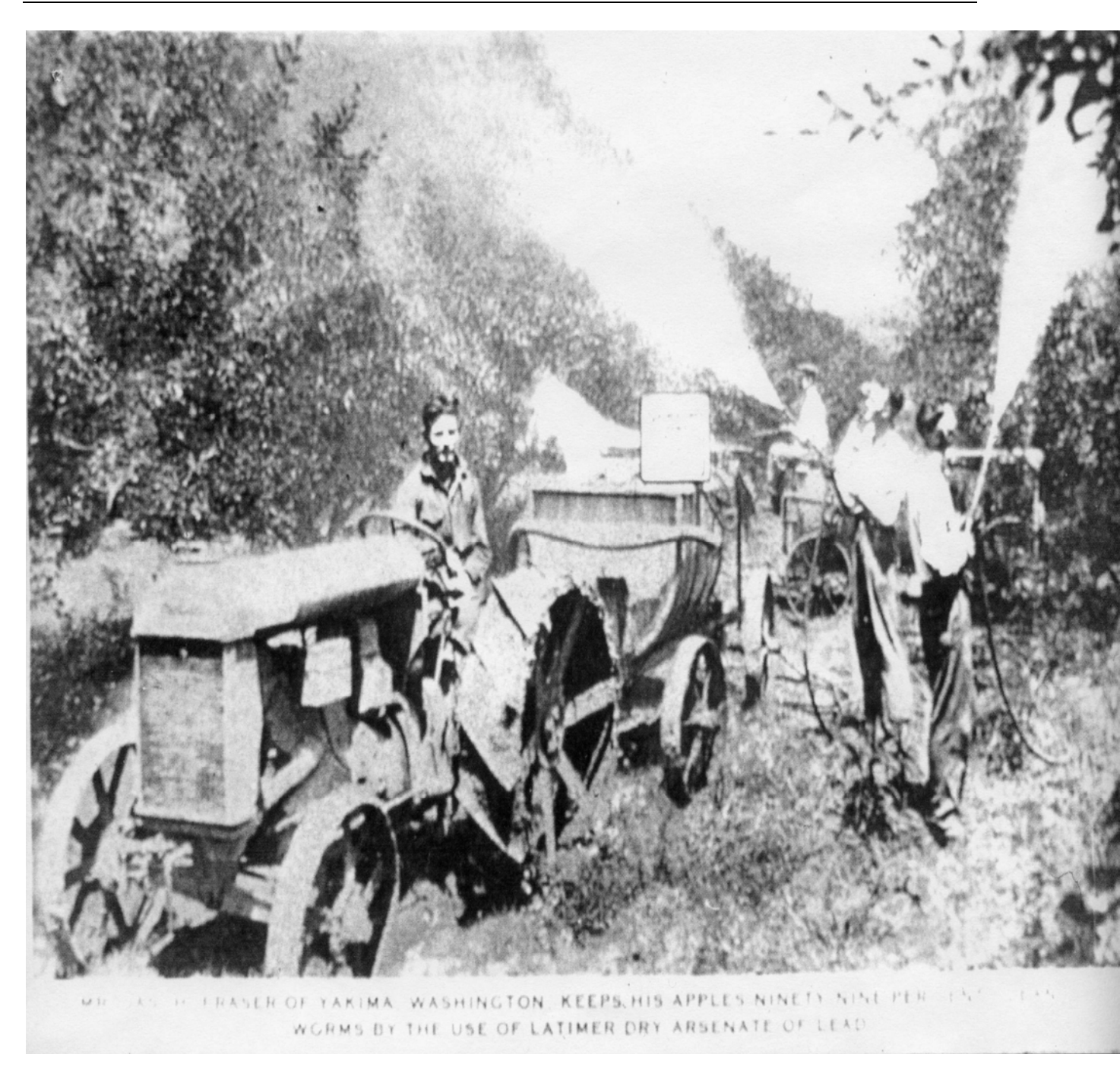
Figure 2. Farmers spraying Lead Arsenate in pears and apples in Eastern Washington.