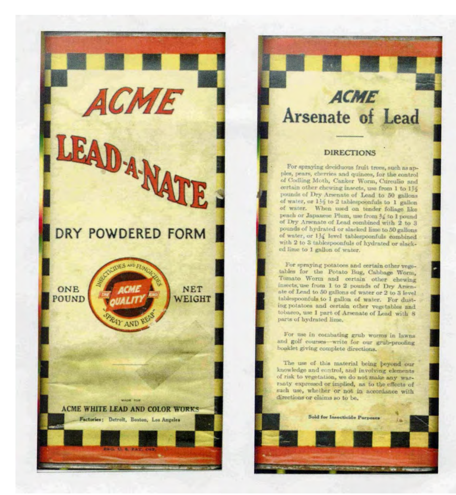
Figure 3. Directions for spraying lead arsenate in deciduous fruit trees, Eastern Washington.