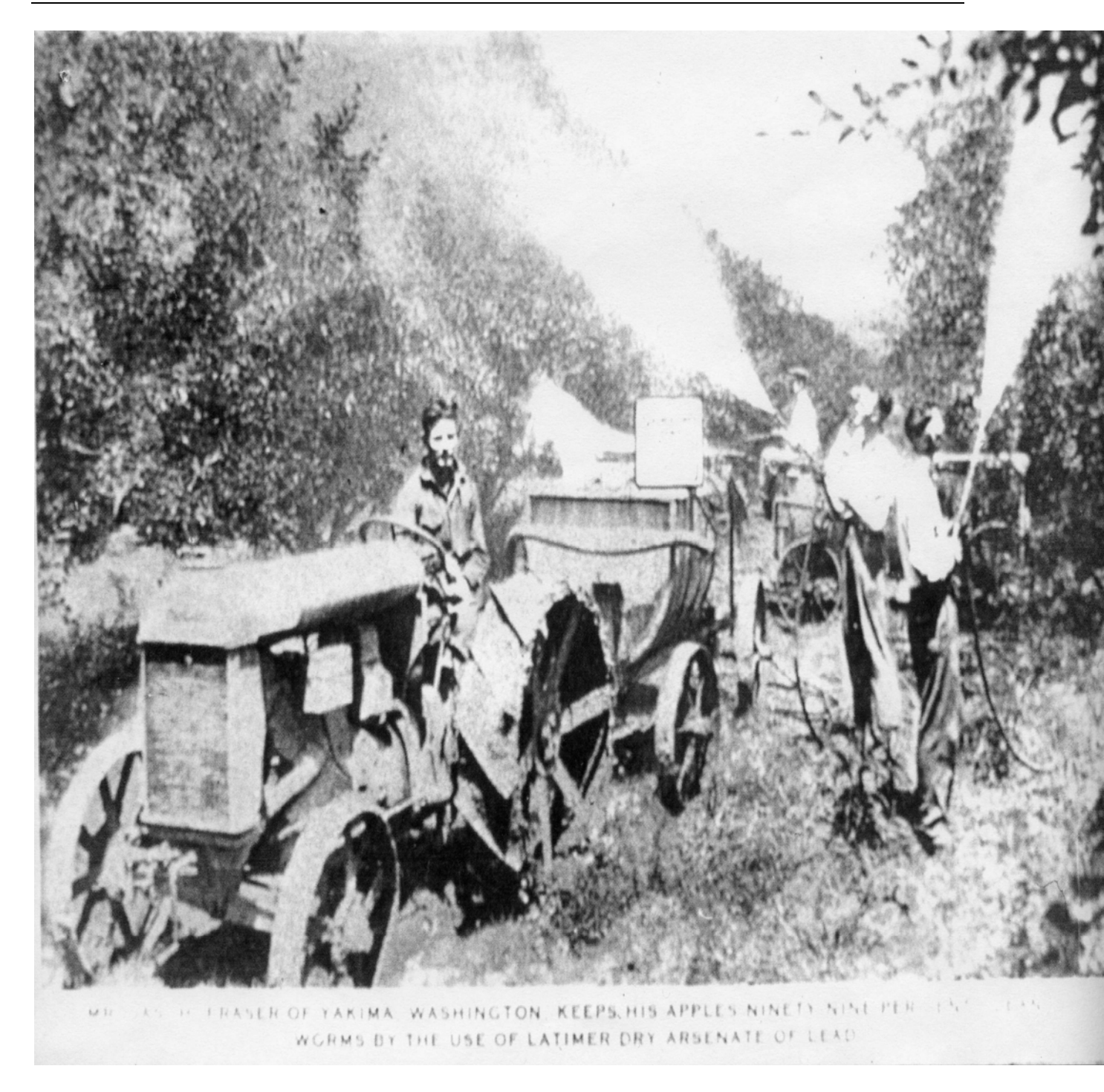
Figure 2. Farmers spraying Lead Arsenate in pears and apples in Eastern Washington.