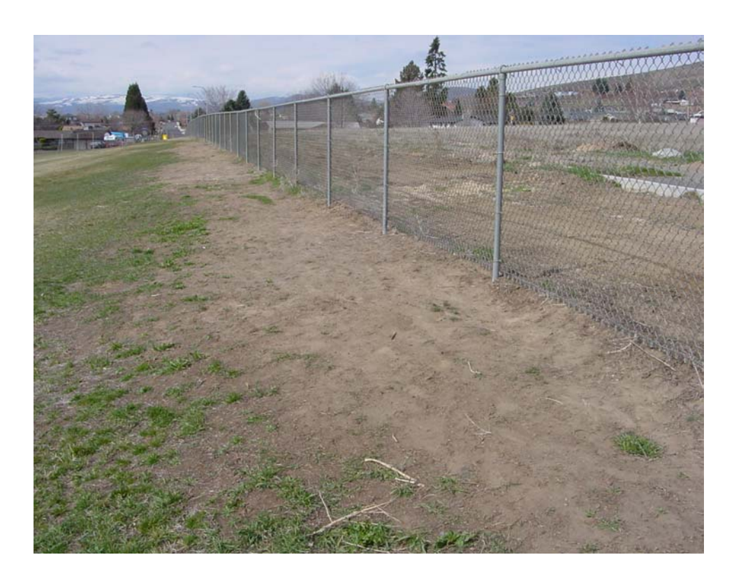
Figure 4. Exposed soil along perimeter fence, Apple Valley Elementary School.