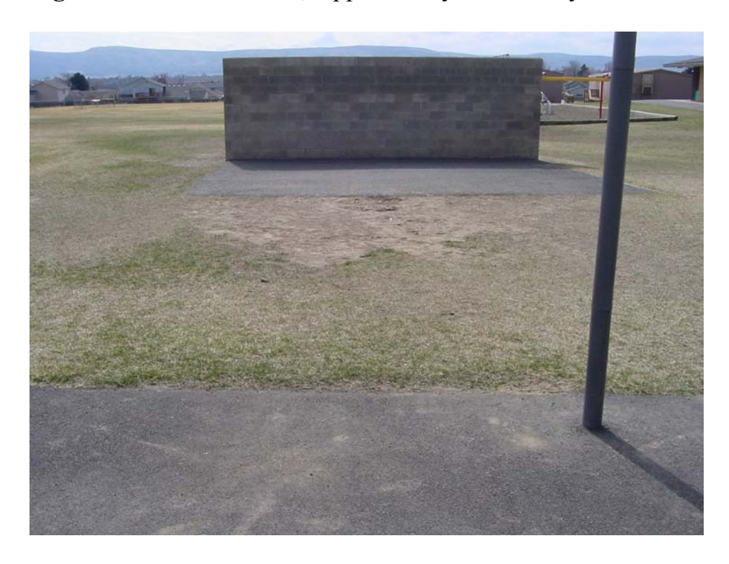
Figure 7. View of dodge ball wall, Apple Valley School.