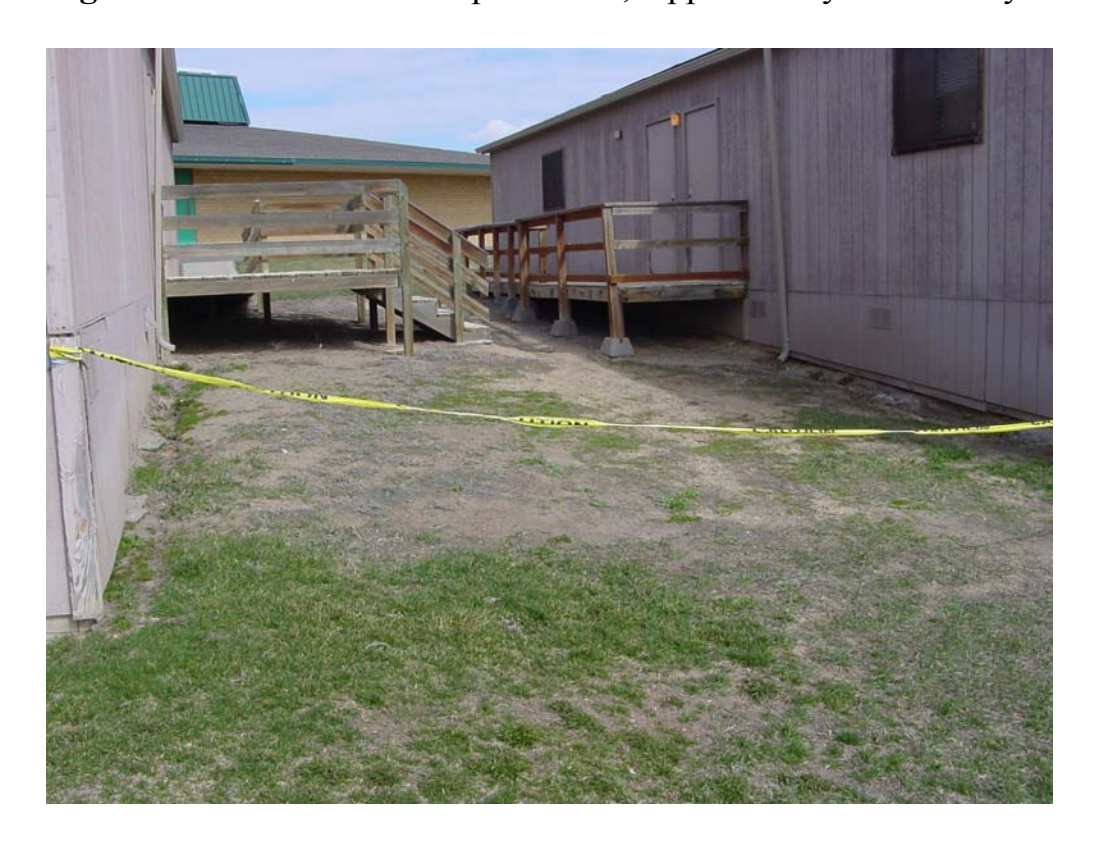
Figure 3. Portable classrooms, Apple Valley Elementary School.