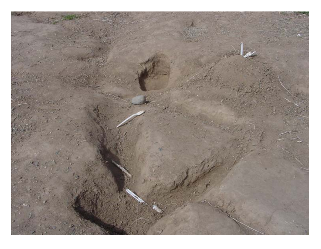
Figure 5. Site where children dig in soil, Apple Valley Elementary School.