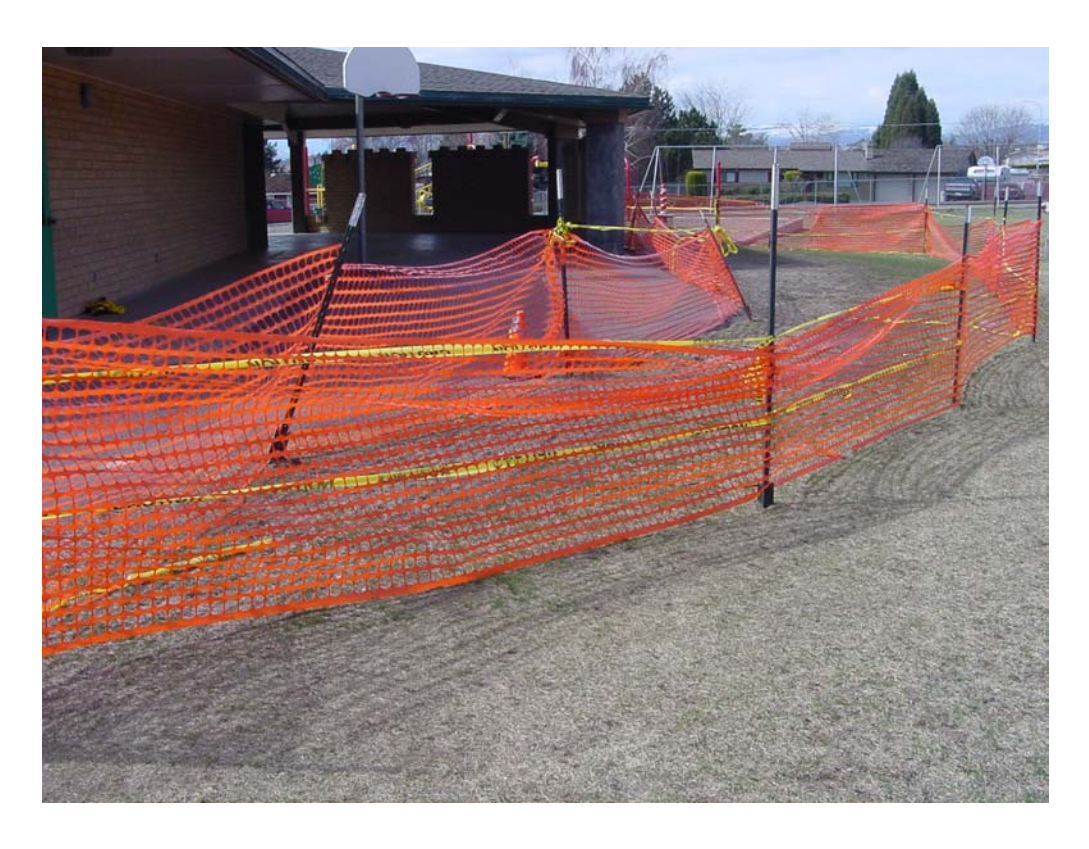
Figure 2. Fenced area of exposed soil, Apple Valley Elementary School.