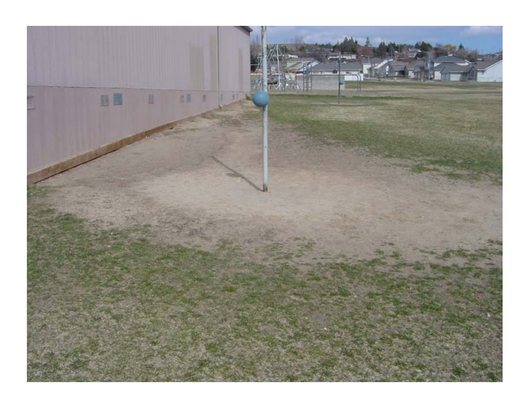
Figure 6. Tetherball area, Apple Valley Elementary School.