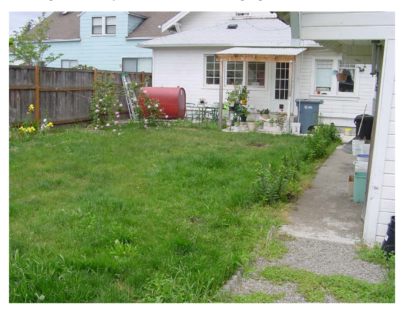
Figure 2. Backyard view of site, including replacement tank.