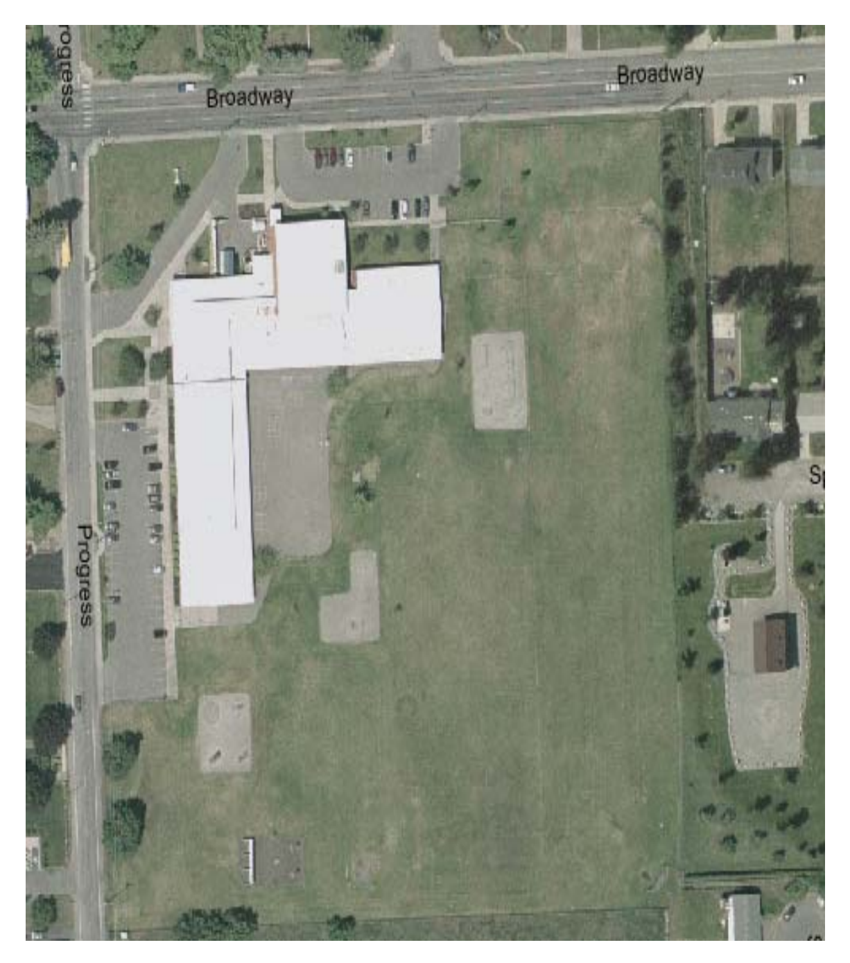
Figure 3. Aerial photo of Progress Elementary School, Spokane, Washington.