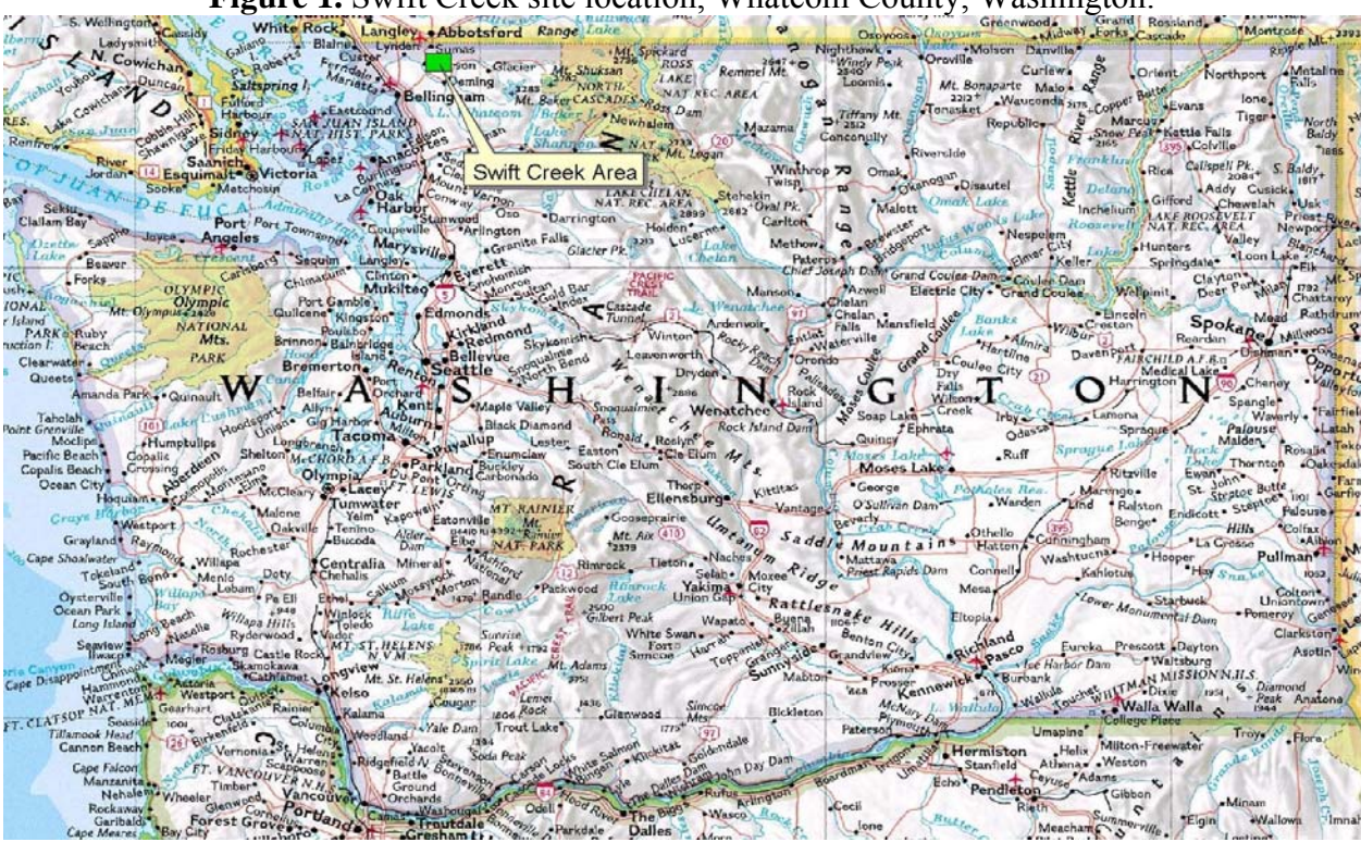
Figure 1. Swift Creek site location, Whatcom County, Washington.