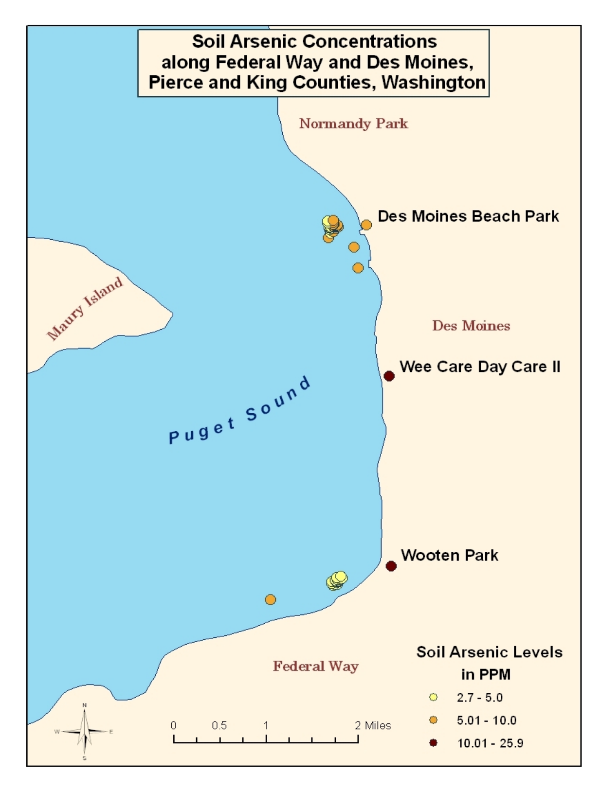
Figure 2. Soil arsenic levels at Federal Way and Des Moines sites, Pierce and King County, Washington.