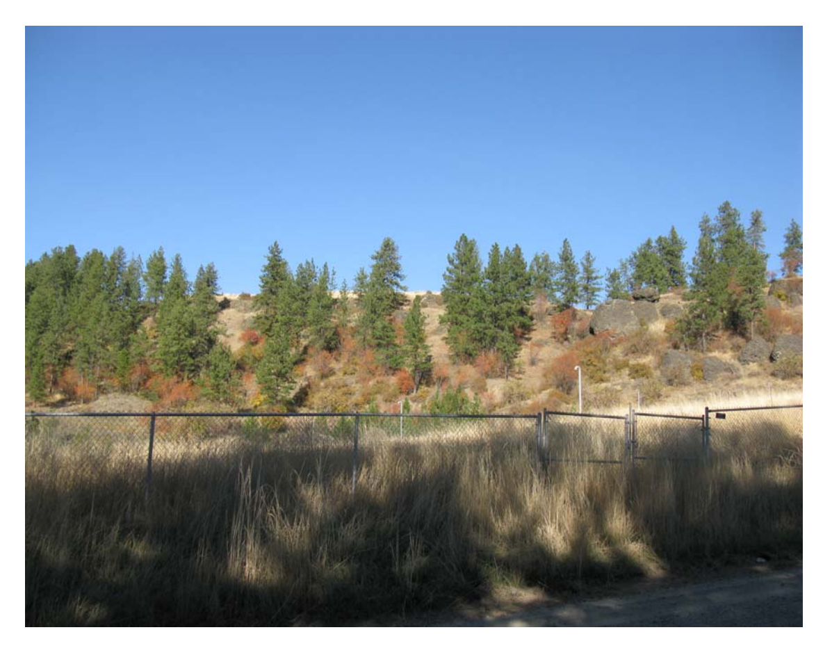
Figure 2 : Looking southwest to northeast at the Heglar Kronquist site, Mead, Spokane County, Washington (October 22, 2008)