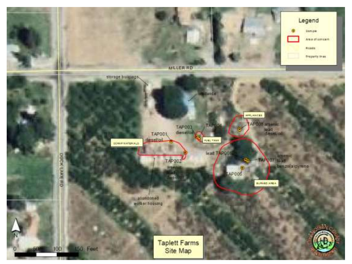
Figure 2. Okanogan County Public Health soil sampling locations of Taplett Farms, Omak, Okanogan County, Washington (sampling area is approximately one acre, full extent of property not shown).

In April 2009, OCPH analyzed surface soil samples collected from eight hot-spot locations on the one-acre, non-orchard area suspected to be contaminated (Figure 2) (6;7). The remaining orchard portion of the property has not been characterized. The samples were analyzed for metals (samples 1–8); polycyclic aromatic hydrocarbons (PAHs) (samples 5, 6, and 7); and fuels (diesel and motor oil) (samples 1, 2, 3, 4, and 8). One sample was analyzed for organochlorine and organophosphate pesticides (sample 3). This sample was taken from what appeared to be the area that pesticides were formerly prepared for application.