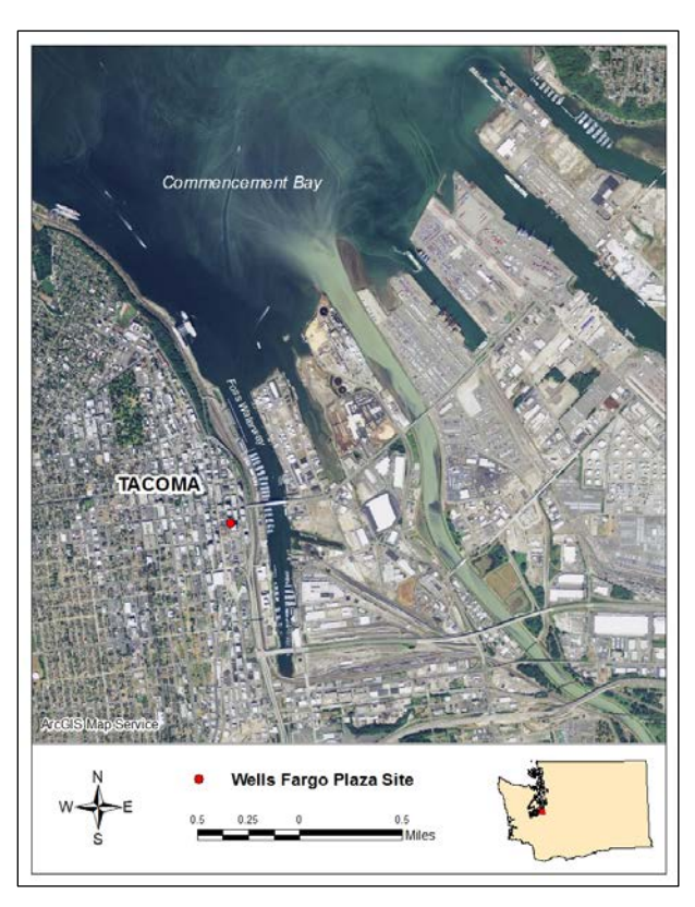
Figure 2 : Vicinity map of site and location in Tacoma, Washington

There are 209 structural variations of PCBs, referred to as congeners, which differ in the number and location of chlorine atoms in the chemical structure. Most PCBs commercially produced in the U.S. were standard mixtures called Aroclors. The conditions for producing each Aroclor favor the synthesis of certain congeners, giving each Aroclor a unique pattern based on its congener composition. No Aroclor contains all 209 congeners.