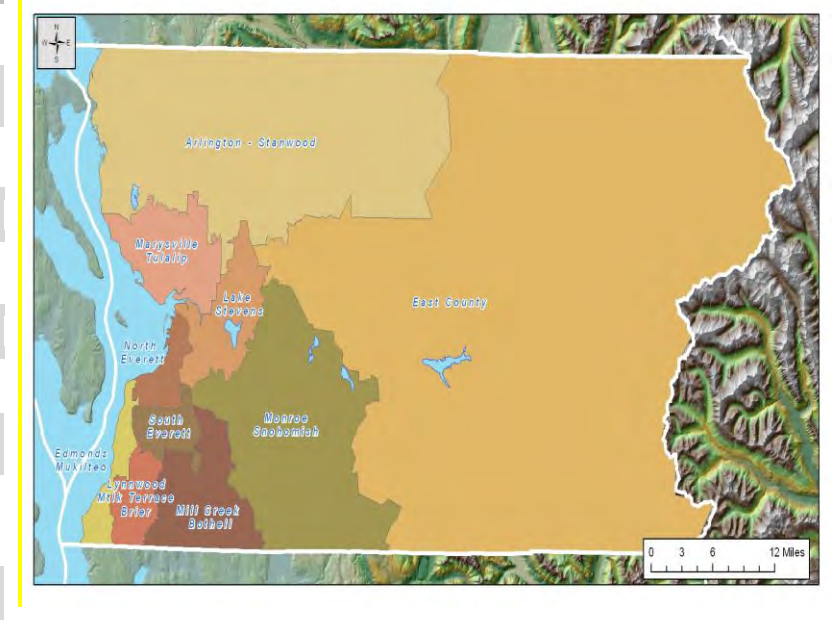
Snohomish County Health Planning Areas (HPA), 2010