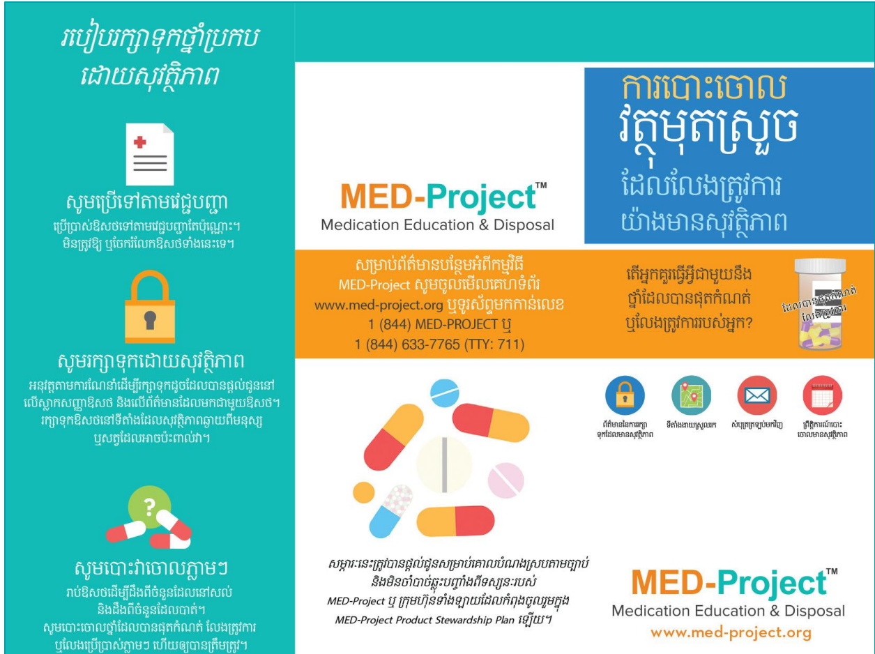
Figure 14: MED-Project Brochure Front (Khmer)