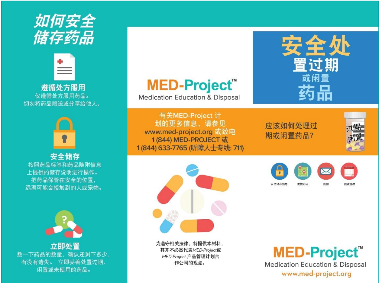
Figure 6: MED-Project Brochure Front (Chinese)