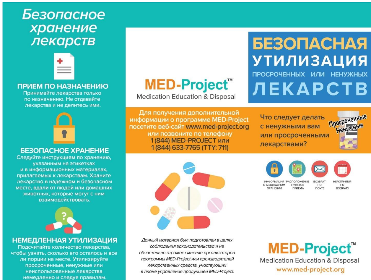
Figure 8: MED-Project Brochure Front (Russian)