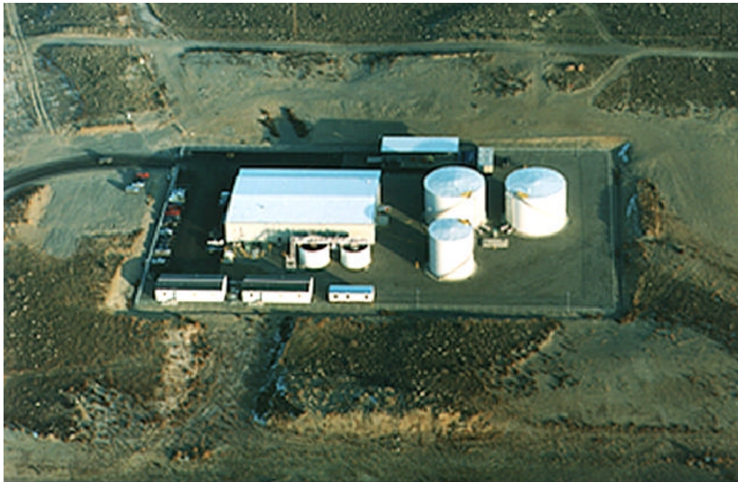
Liquid Treatment Facilities - 300 TEDF

The process waste water stream consists primarily of potable water, equipment cooling water, steam condensate, water treatment salts, and laboratory and research waste water. The mean daily flow rate is currently in the range of 100 to 250 gallons per minute, with maximum spikes attaining 1200 gallons per minute.