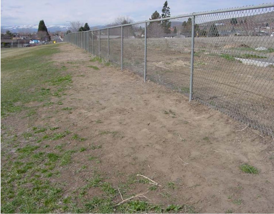
Figure 4. Exposed soil along perimeter fence, Apple Valley Elementary School.