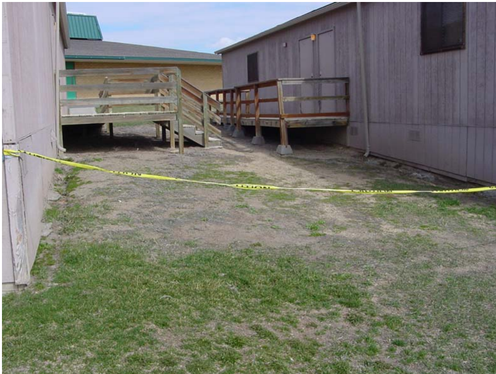
Figure 3. Portable classrooms, Apple Valley Elementary School.