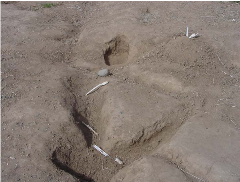
Figure 5. Site where children dig in soil, Apple Valley Elementary School.