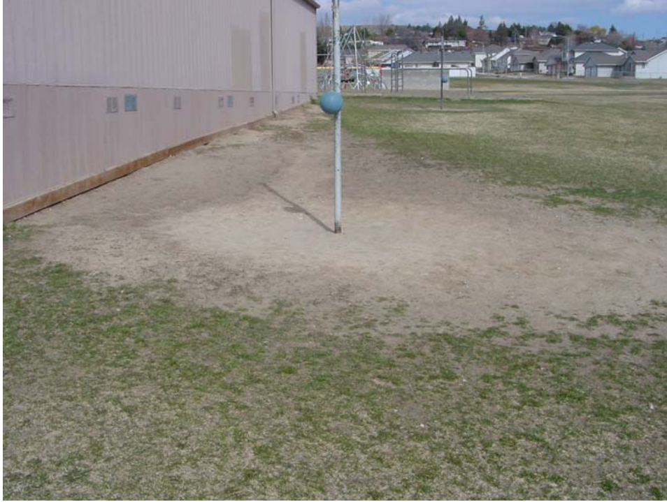
Figure 6. Tetherball area, Apple Valley Elementary School.