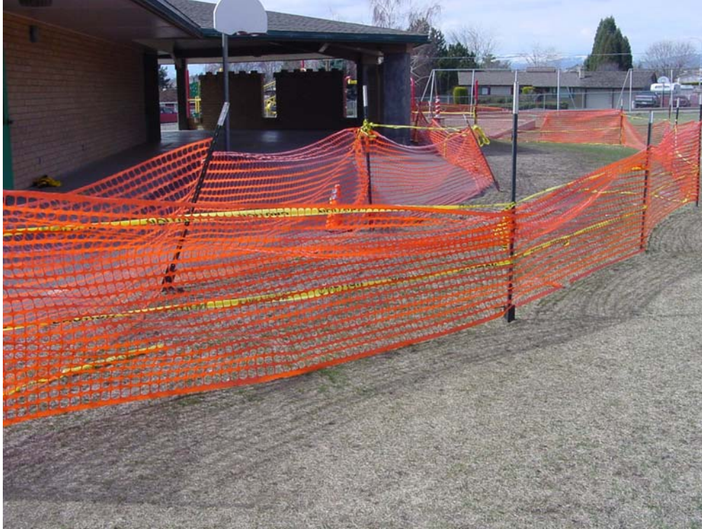
Figure 2. Fenced area of exposed soil, Apple Valley Elementary School.