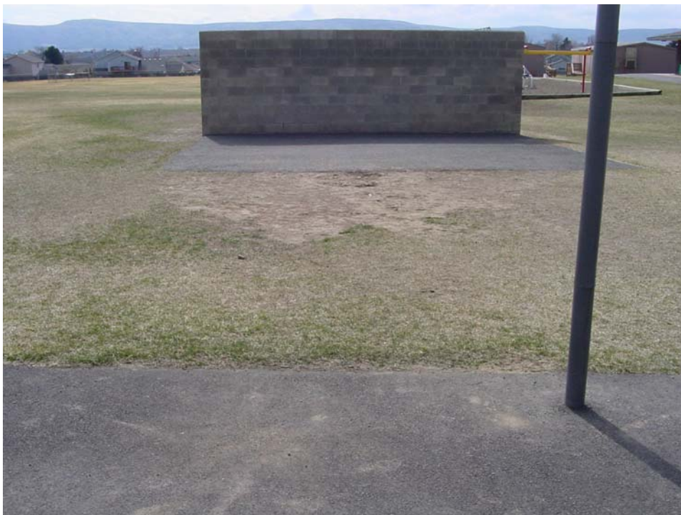
Figure 7. View of dodge ball wall, Apple Valley School.