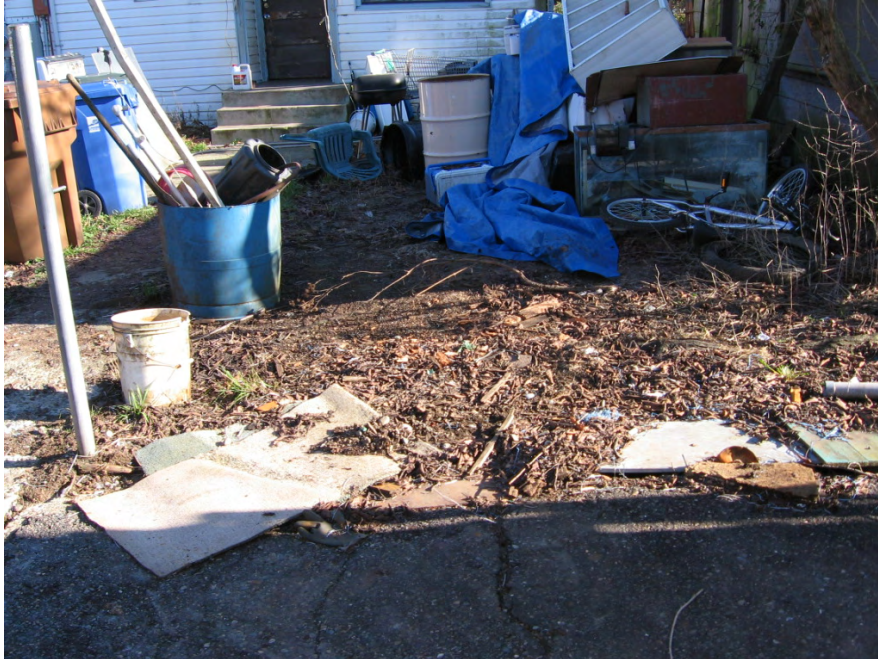
Photo 4. Backyard area between garage and house. Soil sample was collected from the area immediately adjacent to the concrete.