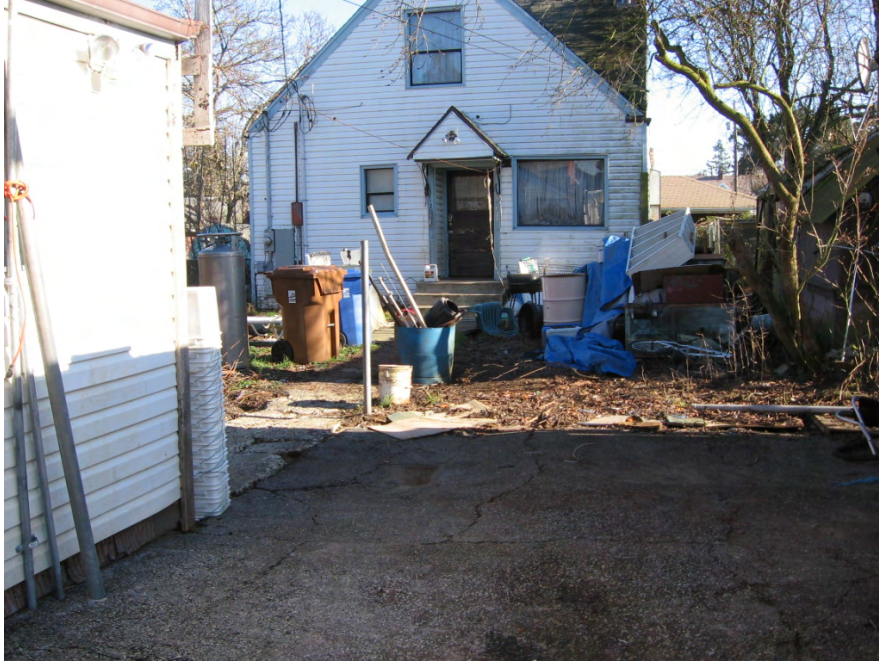
Photo 2. Buckets containing metal debris in the back yard.

Photo 1. Driveway and yard area. Not visible in this photo are stack of buckets on the right side, some containing metal debris.