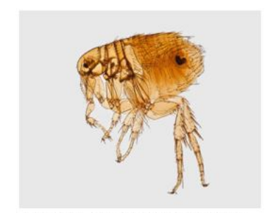
Rat flea, a vector of plague

Bubonic plague, returning in 1346-1353, was known at the time as the Black Death. In those years a third or more of the people in Europe may have died of plague, and the population took an estimated 200 years to rebound to pre-plague levels. The result was severe disruption of existing political and religious social