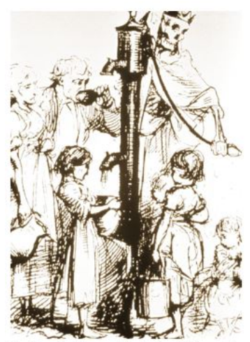
Centers for Disease Control and Prevention

For centuries, bubonic plague outbreaks continued in Europe. John Graunt documented the plague year of 1665 in mortality records he compiled for London. He noted 9,967 births and 87,326 deaths of which 68,595 were attributed to plague, giving a net population loss of 77,359. In contrast, the prior year there had been 8,097 deaths reported, only five due to plague.