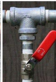
Galvanized Steel & bojet