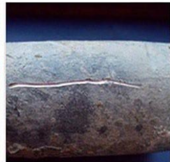
Lead eo emōj an kurar