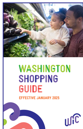
NEW SHOPPING GUIDE