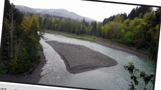
The Elwha River is included in the governor's March 13 drought declaration.