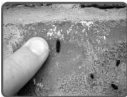
Bat feces often sticks to walls.