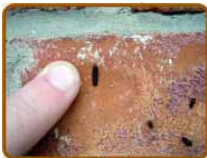
Bat feces often sticks to walls.

Look for droppings. Musty-smelling bat feces look similar to rodent and bird feces, but often adhere to a vertical surface. Bat feces easily crush into fine, shiny, undigested insect parts. Often, you can see bats hanging from the ceiling areas.